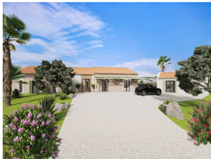
Beautiful construction project