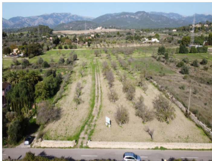
Turnkey construction project