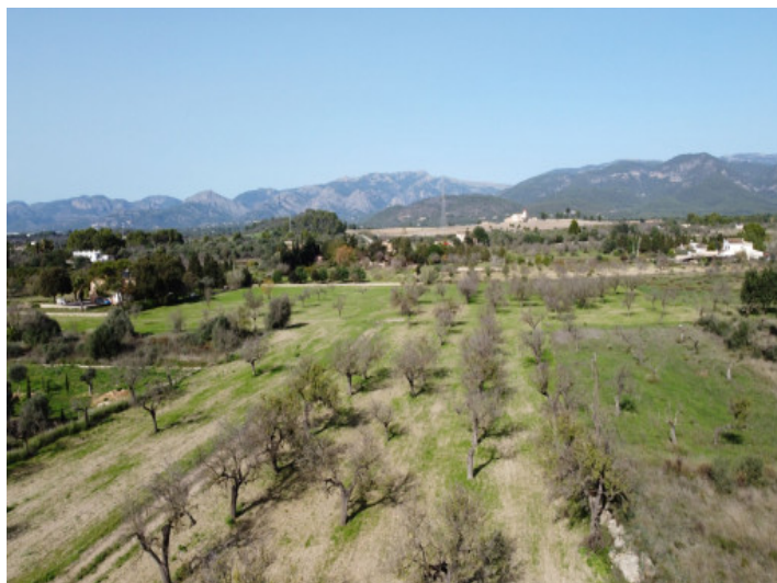
Plot with Tramuntana views