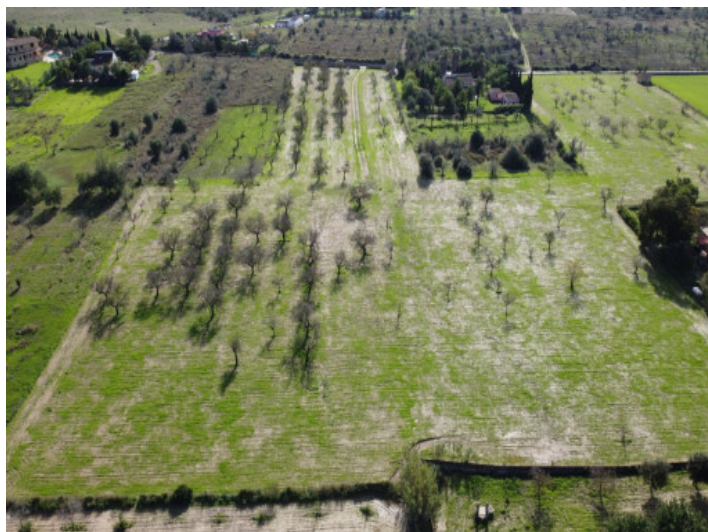
Plot of 22.000sqm