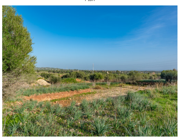
Plot with sea views