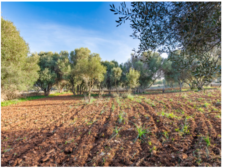
Close to Porto Cristo

All information is correct to the best of our knowledge. Errors and prior sale excepted. This prospectus is purely for information purposes. Only the notarized deed of sale is legally binding.