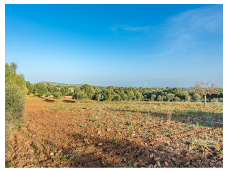
An approx. 69 sqm pool with adjoining sun terrace is planned

All information is correct to the best of our knowledge. Errors and prior sale excepted. This prospectus is purely for information purposes. Only the notarized deed of sale is legally binding.