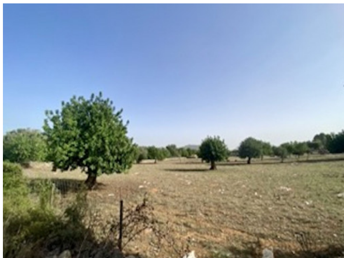
Exceptional building plot in a perfect location with sea views in Son