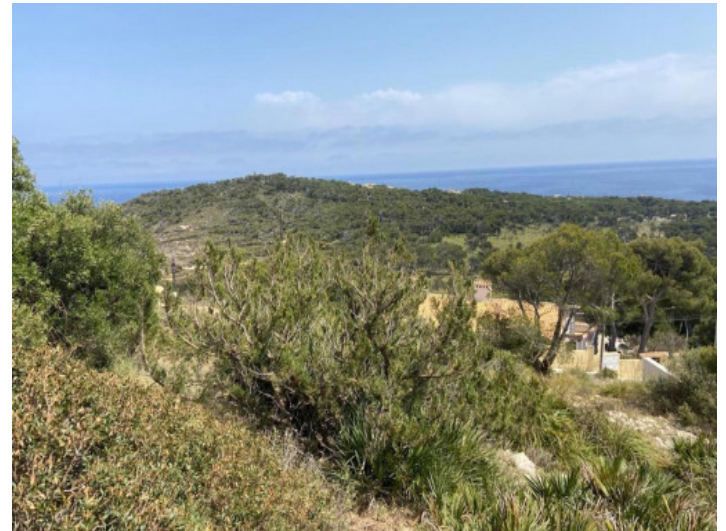
View of the plot