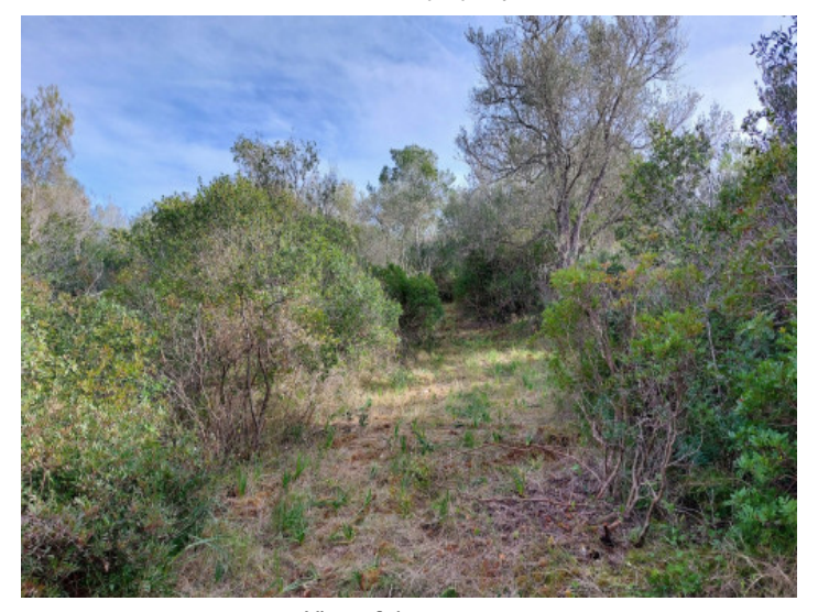
View of the property

All information is correct to the best of our knowledge. Errors and prior sale excepted. This prospectus is purely for information purposes. Only the notarized deed of sale is legally binding.