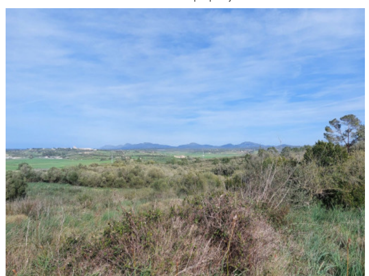
View of the property