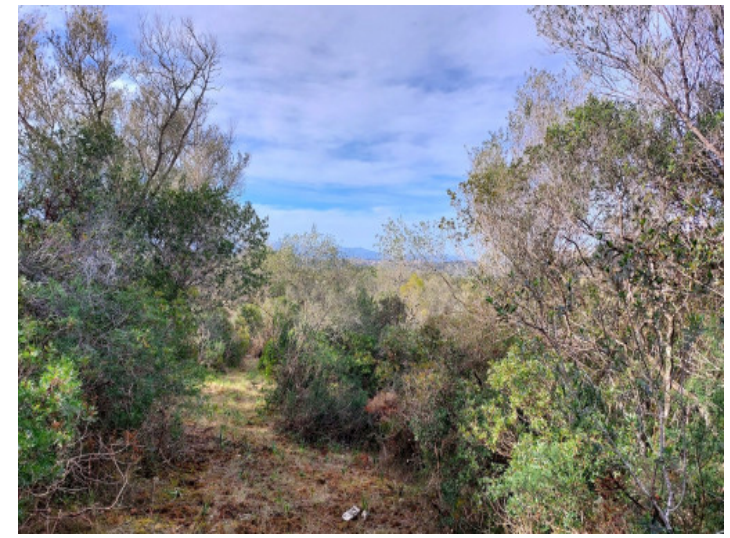
View of the property