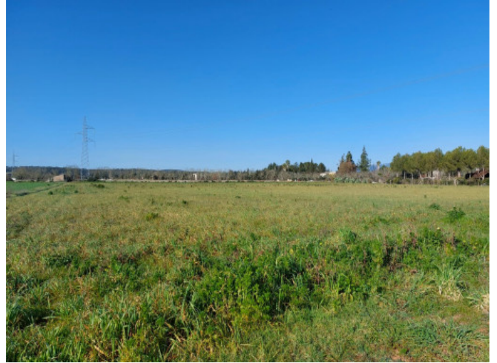
View of the plot