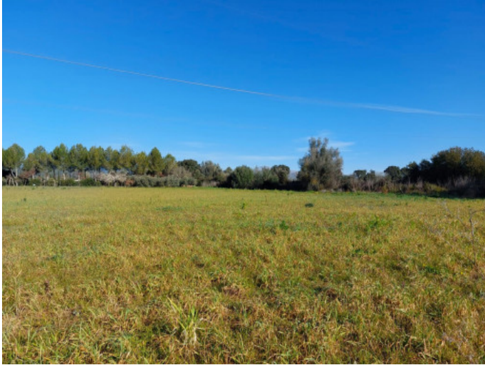
View of the plot