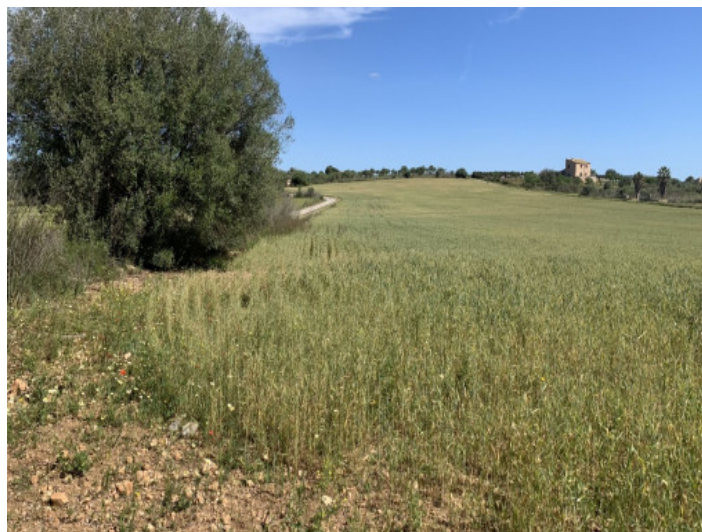
Plot with project