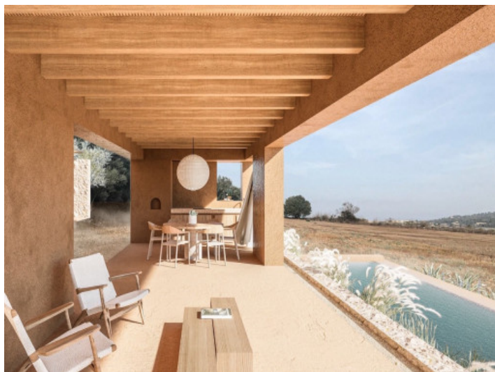
Plot with building project in Villafranca de Bonany