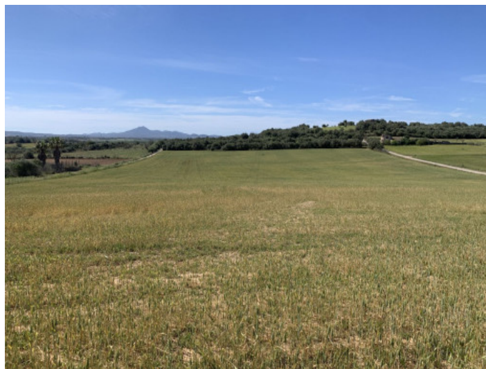
Plot with project