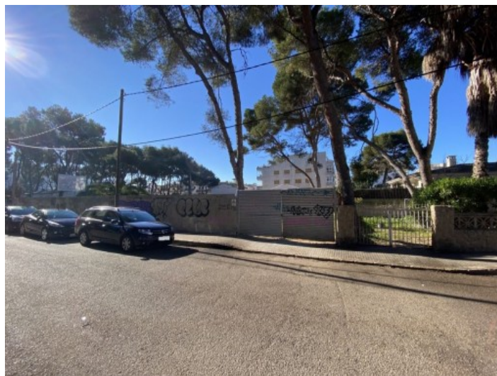
View from the street