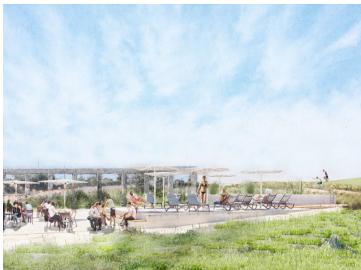
Possible pool area