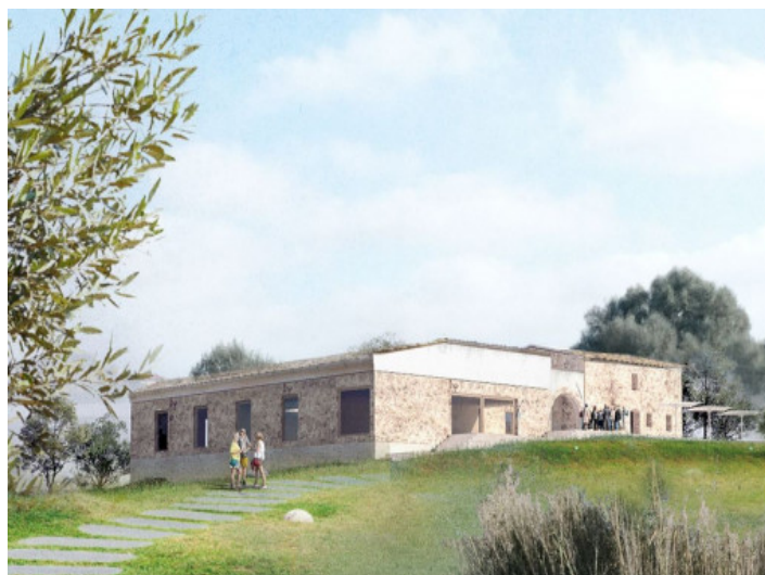
Exterior view of the project

All information is correct to the best of our knowledge. Errors and prior sale excepted. This prospectus is purely for information purposes. Only the notarized deed of sale is legally binding.