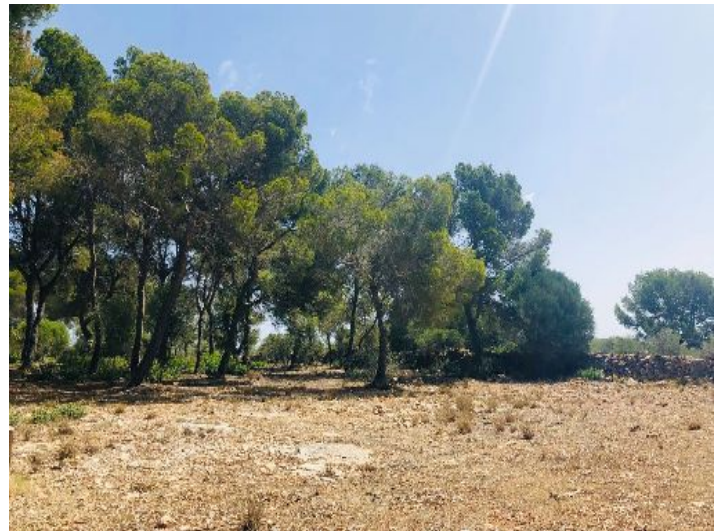
View of the plot