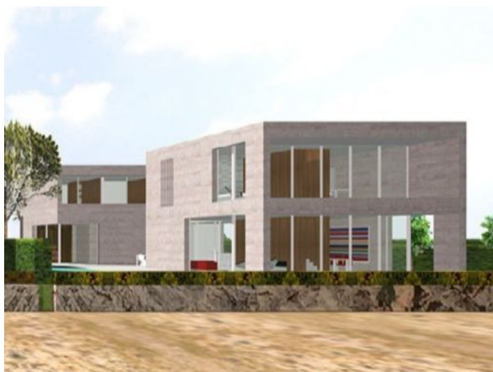
Alternative view of the project