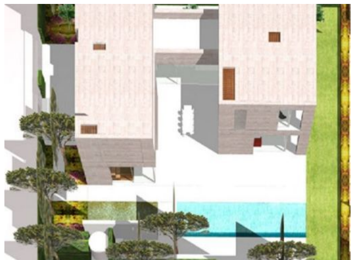
Alternative view of the project

All information is correct to the best of our knowledge. Errors and prior sale excepted. This prospectus is purely for information purposes. Only the notarized deed of sale is legally binding.