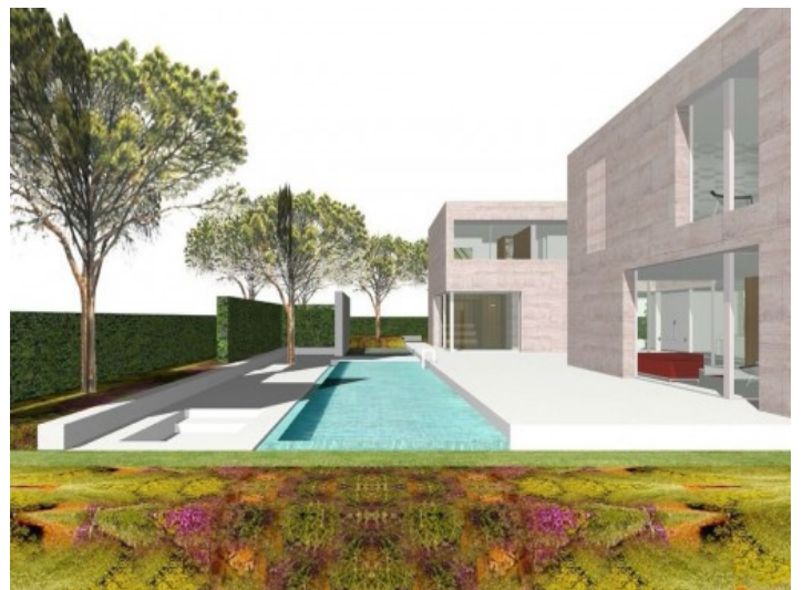
Alternative view of the project