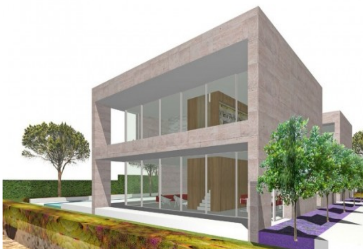
View of the project