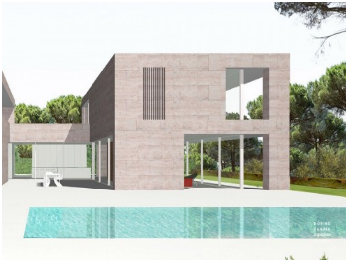
Plan of the villa