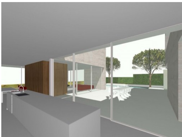
Alternative view of the project