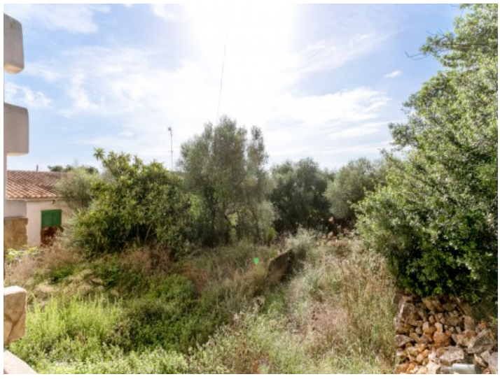
Alternative view of the plot