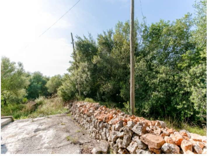
View of the plot