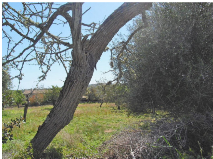
A detached house of approx. 400 sqm can be built