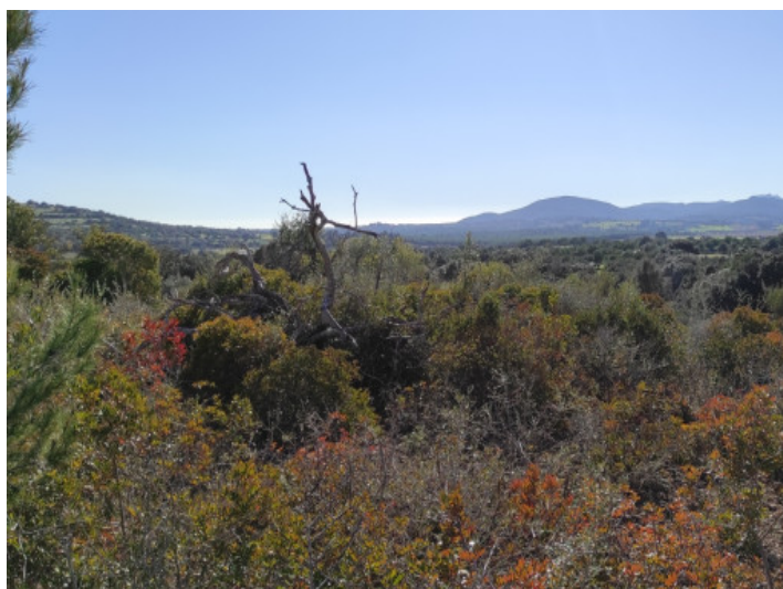
Beautiful nature surrounds the plot