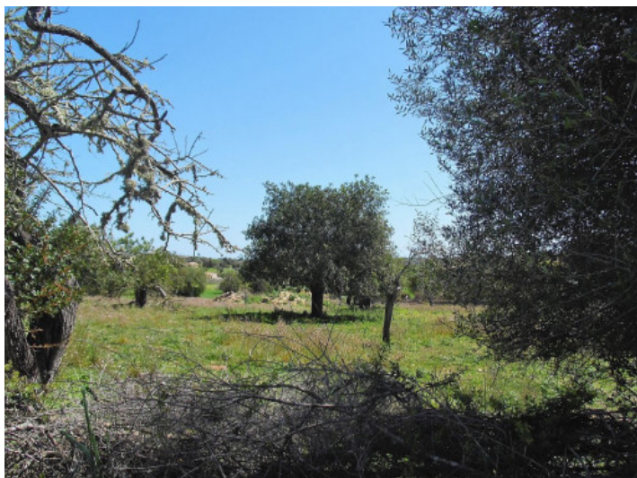
The plot is quietly situated

All information is correct to the best of our knowledge. Errors and prior sale excepted. This prospectus is purely for information purposes. Only the notarized deed of sale is legally binding.