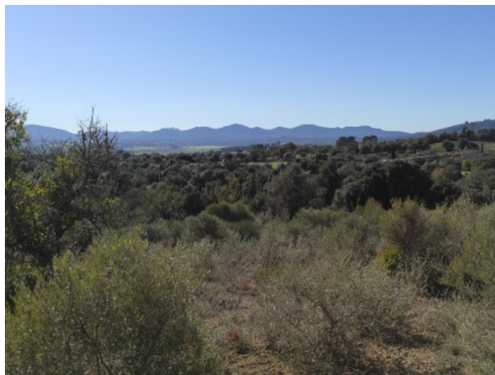
Idyllic building plot