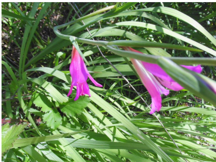
On the plot are various plants