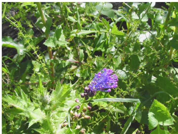
Wonderful, green plot

All information is correct to the best of our knowledge. Errors and prior sale excepted. This prospectus is purely for information purposes. Only the notarized deed of sale is legally binding.