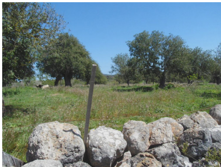
The plot is situated in a beautiful finca location