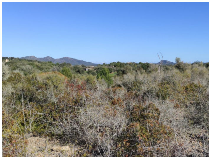
3 building plots are joined together