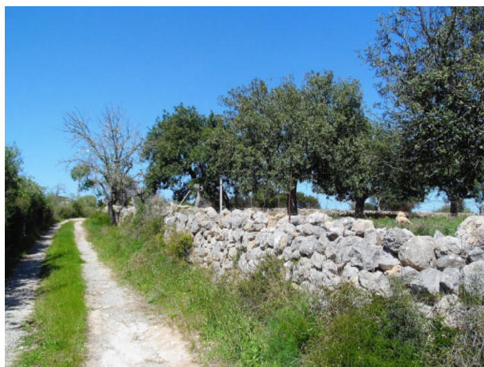
The plot has a total size of 19.500 sqm