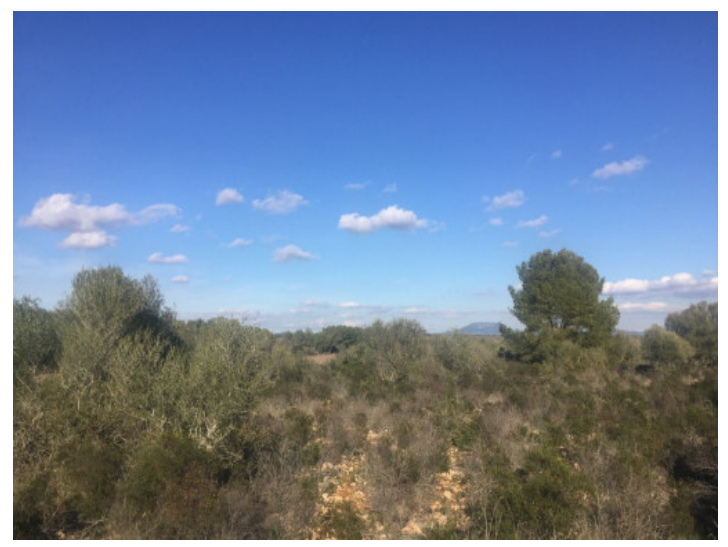
Sweeping views over the countryside