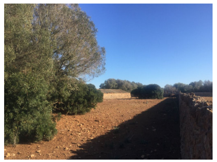
Natural stone wall