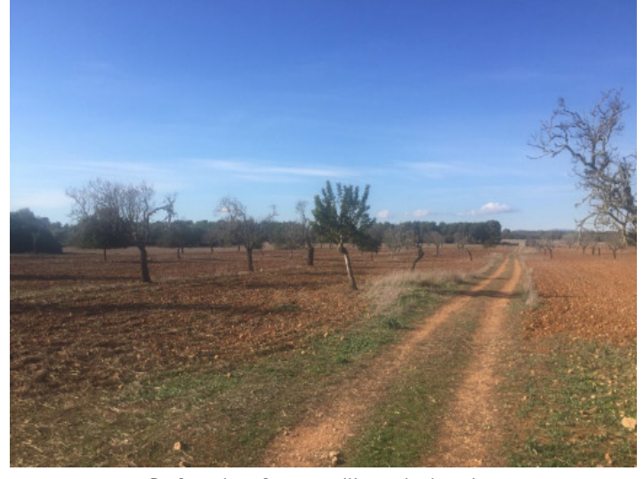
Perfect place for tranquility and relaxation

All information is correct to the best of our knowledge. Errors and prior sale excepted. This prospectus is purely for information purposes. Only the notarized deed of sale is legally binding.