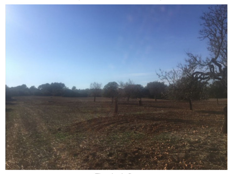
The plot is flat