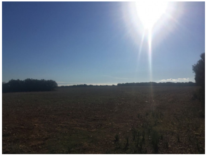
The plot has a size of 206,000 sqm