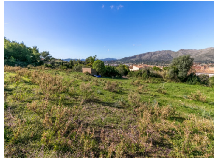
The building plot has a size of 32.625 sqm