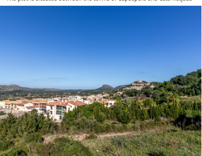
Wonderful views over the mountains and the castle of Capdepera

All information is correct to the best of our knowledge. Errors and prior sale excepted. This prospectus is purely for information purposes. Only the notarized deed of sale is legally binding.