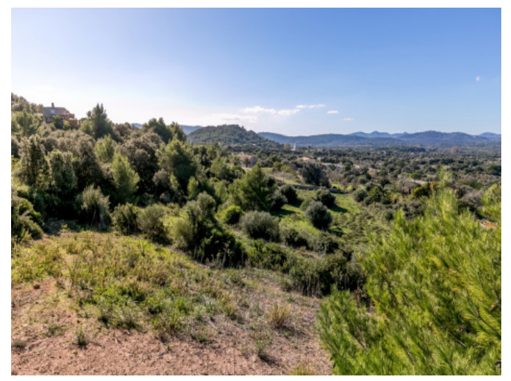
Lovely, hilly landscape