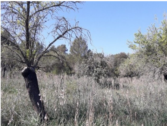
Old stock of trees