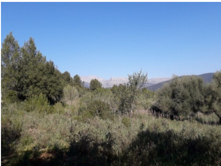
Fantastic views of the Tramuntana