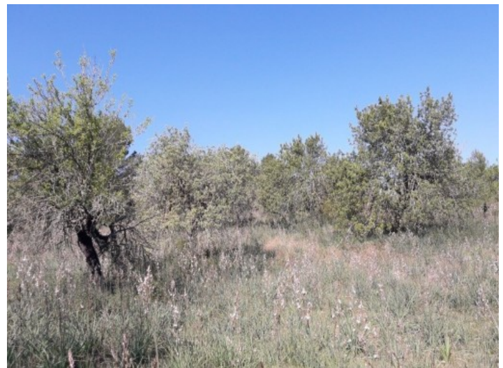
A two-storey country house is possible

All information is correct to the best of our knowledge. Errors and prior sale excepted. This prospectus is purely for information purposes. Only the notarized deed of sale is legally binding.