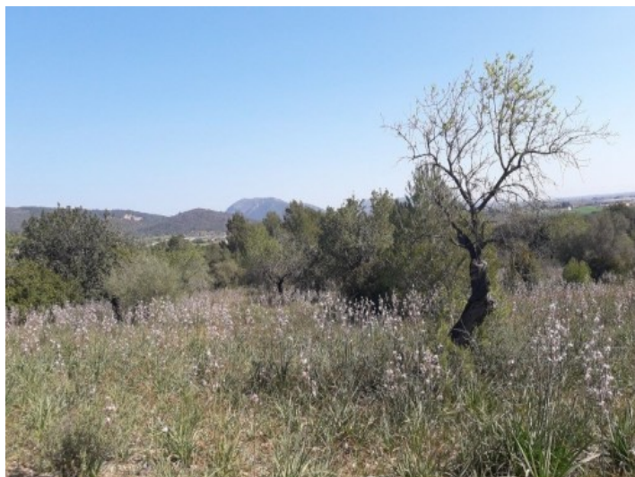
Slight slope allows fantastic views of the surrounding