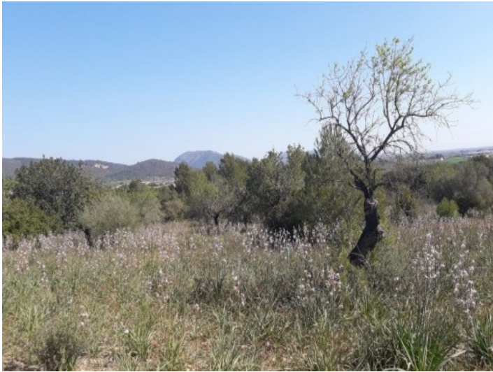
Slight slope allows fantastic views of the surrounding