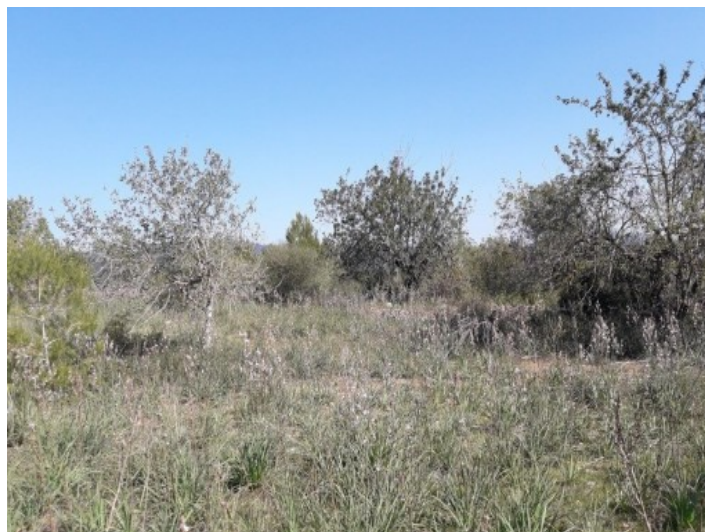
Spacious plot of 43,000 sqm