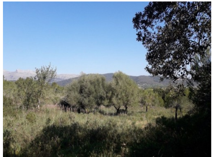
With existing building permit