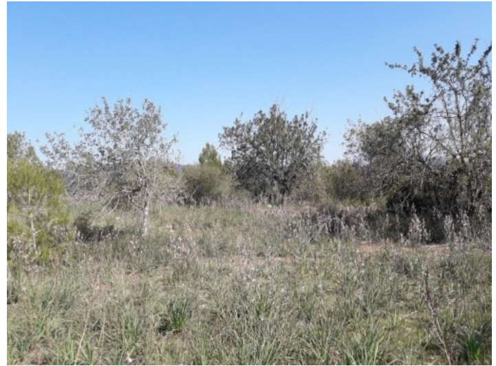
Spacious plot of 43,000 sqm