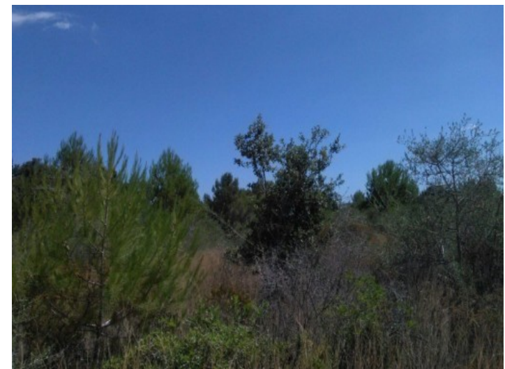
Plot in Son Servera