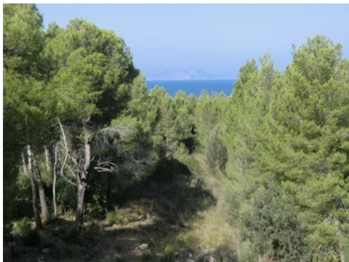
Plot with pine trees