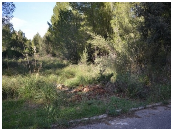
Access to the plot

All information is correct to the best of our knowledge. Errors and prior sale excepted. This prospectus is purely for information purposes. Only the notarized deed of sale is legally binding.