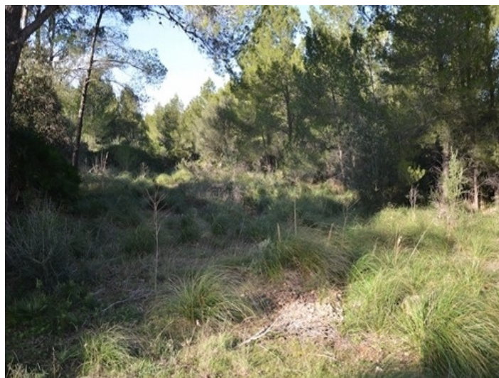
Plot of ca. 1100 sqm