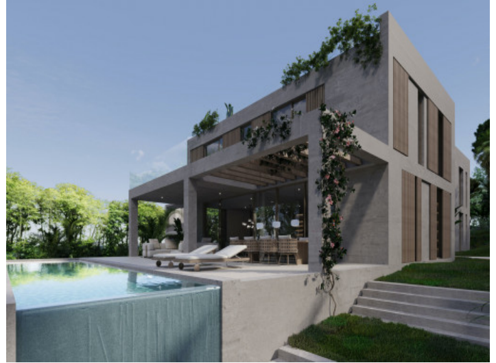
Alternative view of the project