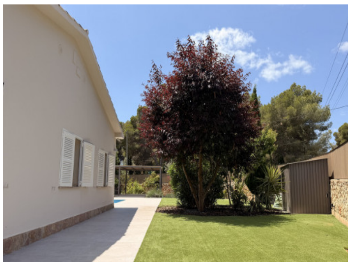
Well-maintained outdoor area

All information is correct to the best of our knowledge. Errors and prior sale excepted. This prospectus is purely for information purposes. Only the notarized deed of sale is legally binding.