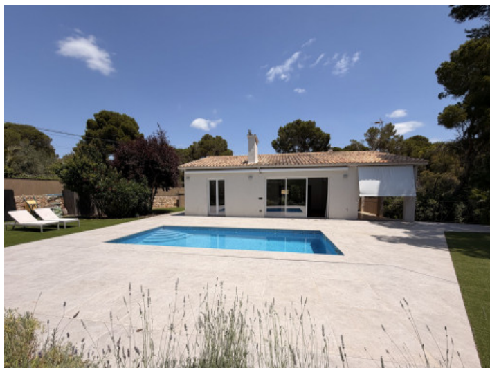
Pool terrace area