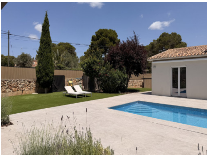
Well-maintained outdoor area