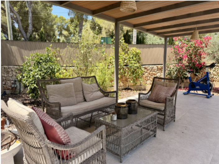
Covered lounge area