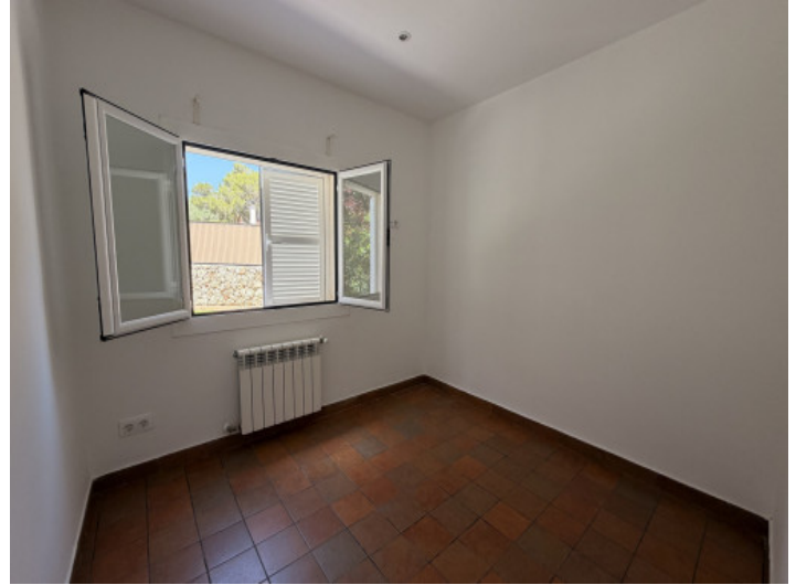
One of the three bedrooms