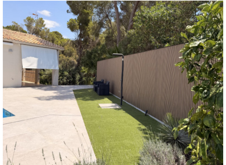
Garden with outdoor shower