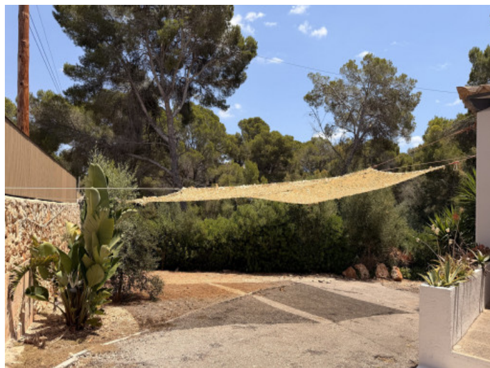
Outdoor parking space