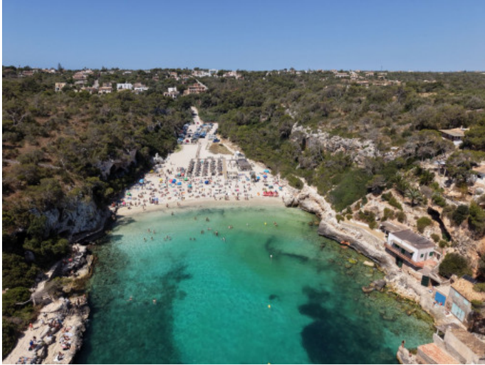
Beach from Cala Llombards