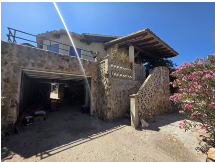
Front Yard with garage