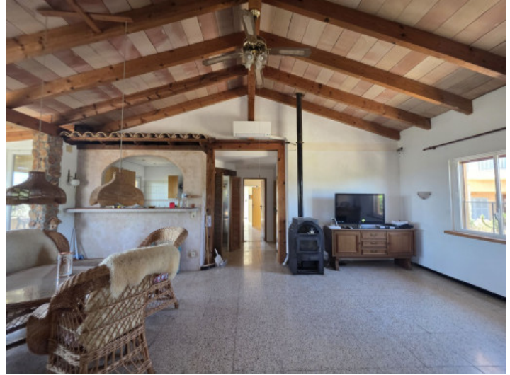
Open living concept