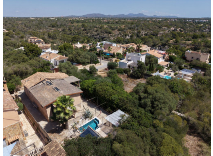
just a few meters from the beach