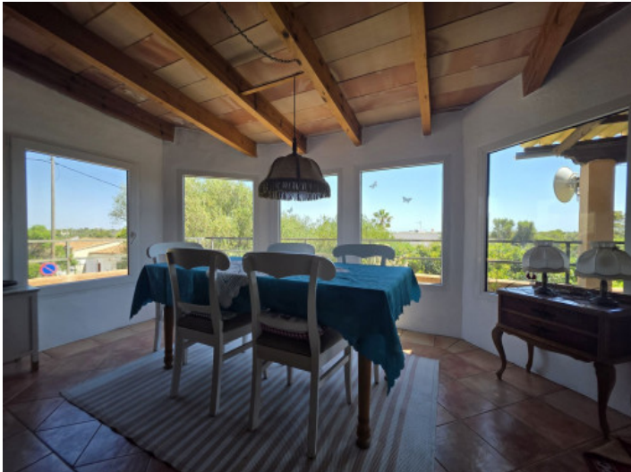
Dining area with views