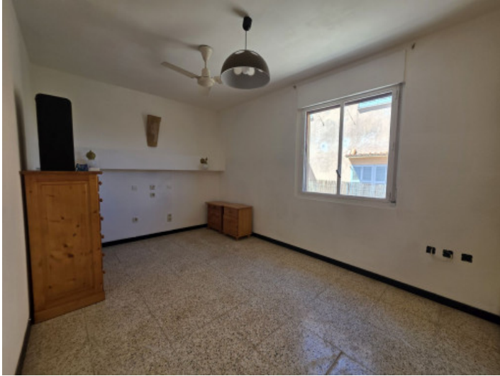
One of three bedrooms