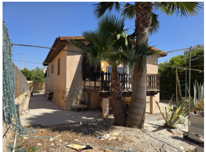
Single family house

All information is correct to the best of our knowledge. Errors and prior sale excepted. This prospectus is purely for information purposes. Only the notarized deed of sale is legally binding.