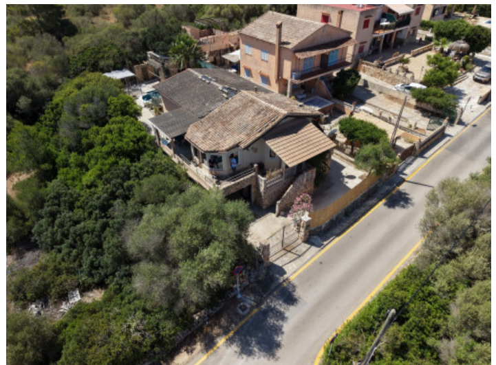
Single family house

All information is correct to the best of our knowledge. Errors and prior sale excepted. This prospectus is purely for information purposes. Only the notarized deed of sale is legally binding.