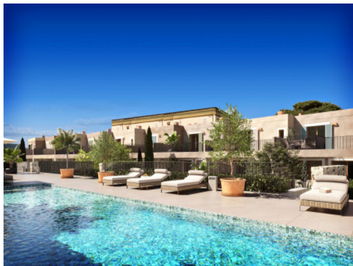
Terraced house with community pool in Arta