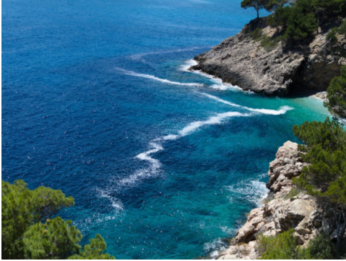
Coast of Arta

All information is correct to the best of our knowledge. Errors and prior sale excepted. This prospectus is purely for information purposes. Only the notarized deed of sale is legally binding.