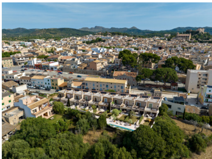
Location in Arta