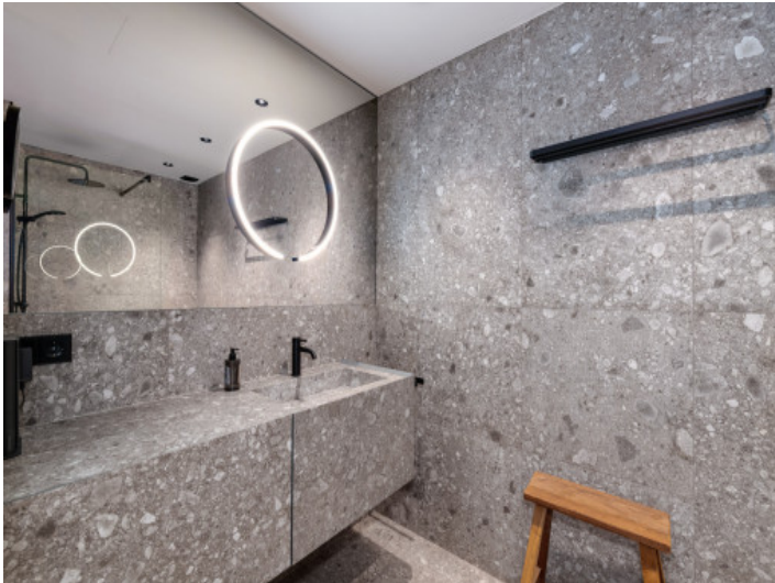
One of the two bathrooms