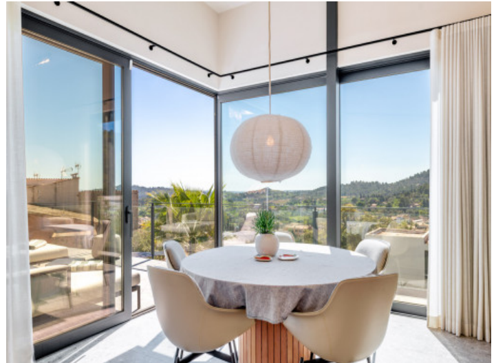
Dining area with panoramic windows and views