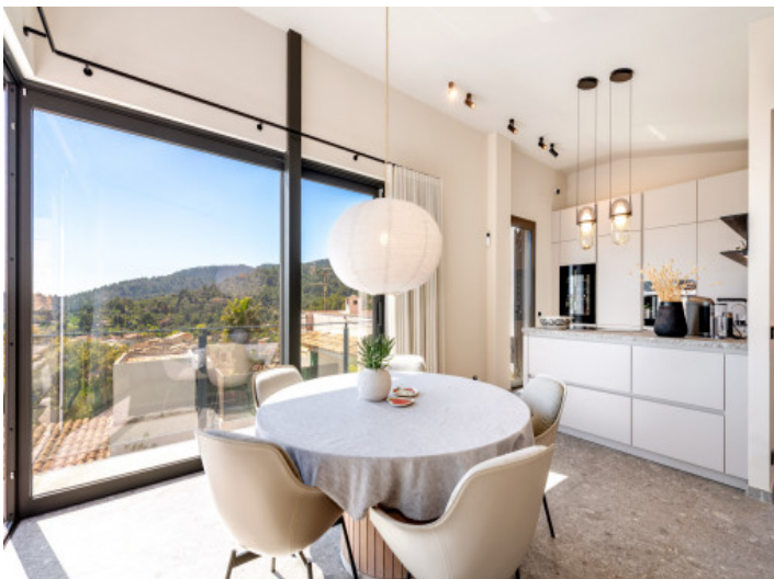
Modern kitchen and dining area on the upper floor