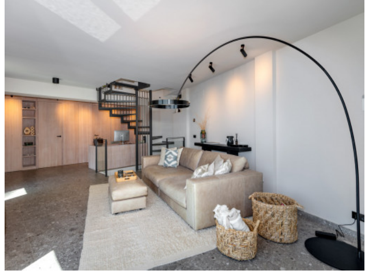
Open-plan living area on the ground floor