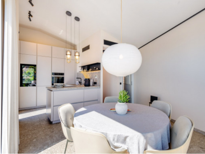
Dining area with panoramic windows and views