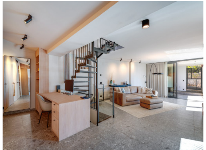
Open-plan living area on the ground floor

All information is correct to the best of our knowledge. Errors and prior sale excepted. This prospectus is purely for information purposes. Only the notarized deed of sale is legally binding.