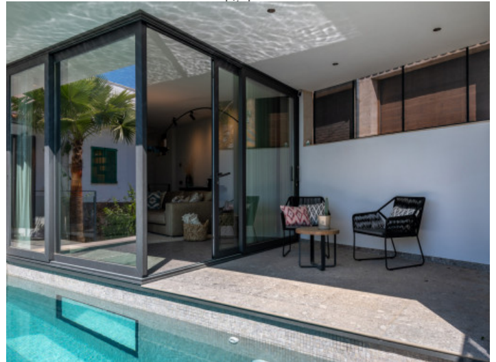
Open-plan living area with seamless transition to the pool area