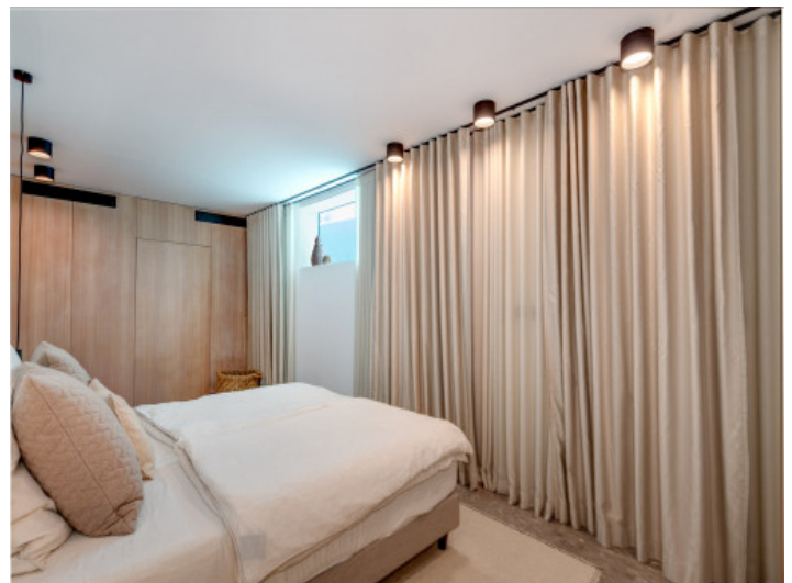
Bedroom in the basement

All information is correct to the best of our knowledge. Errors and prior sale excepted. This prospectus is purely for information purposes. Only the notarized deed of sale is legally binding.