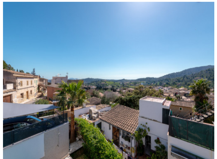
Open views of the landscape

All information is correct to the best of our knowledge. Errors and prior sale excepted. This prospectus is purely for information purposes. Only the notarized deed of sale is legally binding.