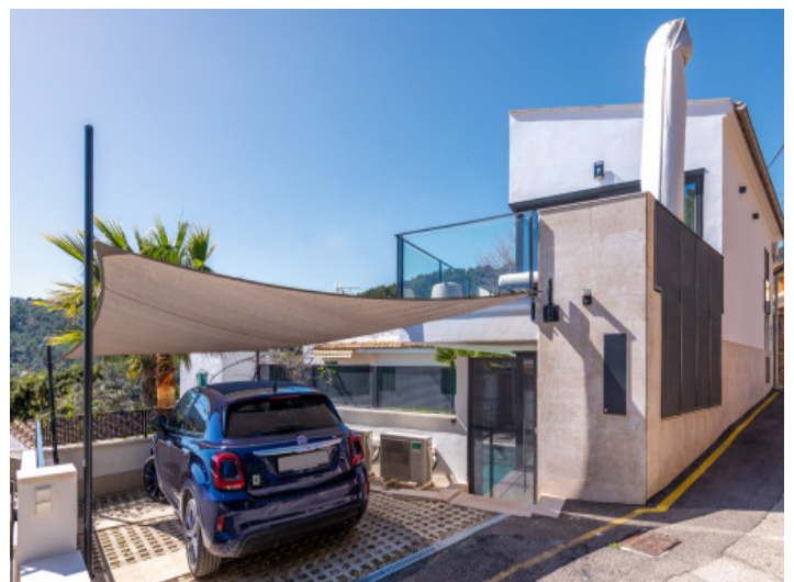
Parking space for one vehicle

All information is correct to the best of our knowledge. Errors and prior sale excepted. This prospectus is purely for information purposes. Only the notarized deed of sale is legally binding.