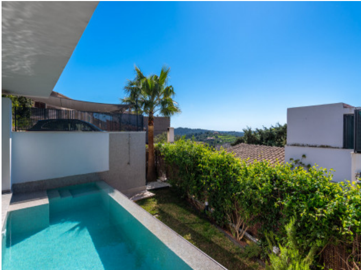
Pool area with sun terrace