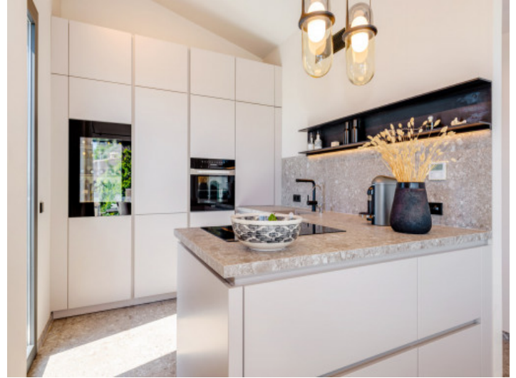
Modern kitchen with high-quality appliances