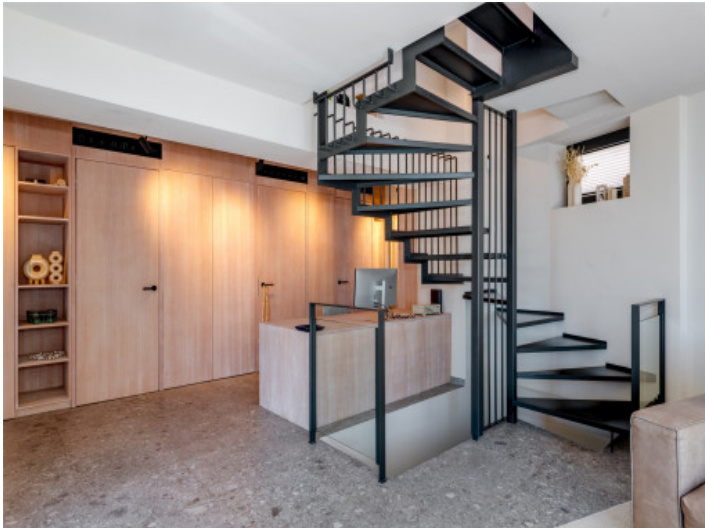
Modern villa architecture