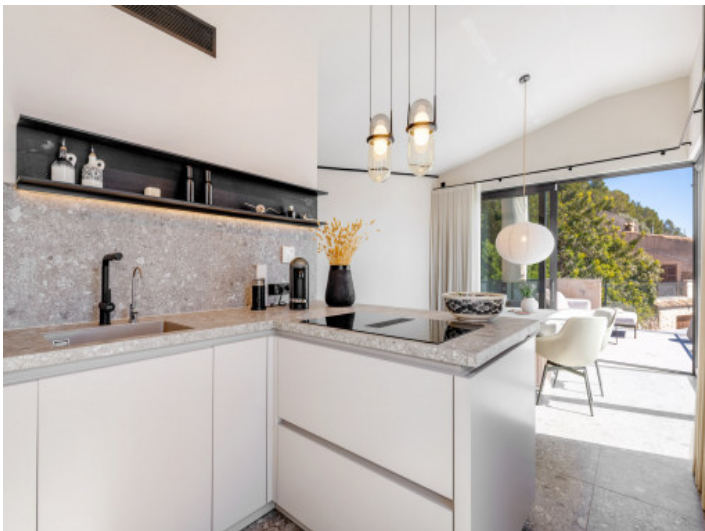
Modern kitchen with high-quality appliances