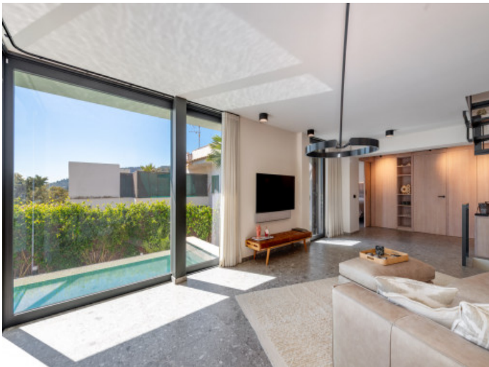
Light-filled living area with large window fronts