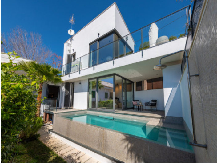
Exterior view of the modern villa with pool