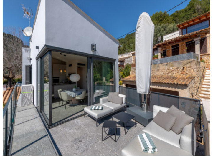
Modern rooftop terrace with seating area and access to the open-plan living area