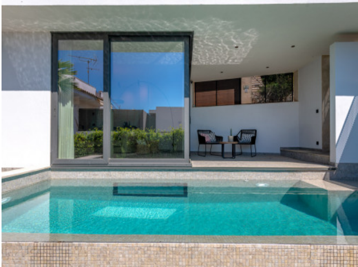
View of the pool terrace