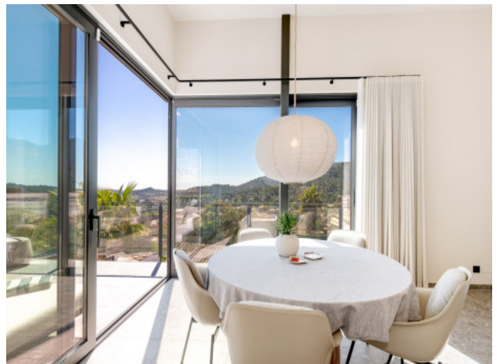
Dining area with panoramic windows and views

All information is correct to the best of our knowledge. Errors and prior sale excepted. This prospectus is purely for information purposes. Only the notarized deed of sale is legally binding.