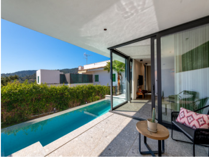
Pool and garden