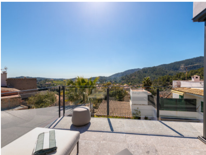
Open views of the landscape