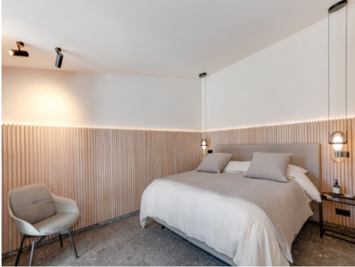
Bedroom on the ground floor