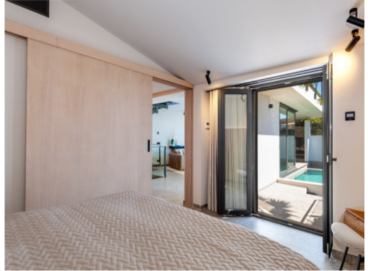
Bright bedroom with access to the outside