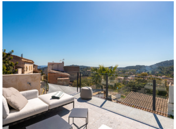
Rooftop terrace with wide views over Alaró and the surrounding landscape