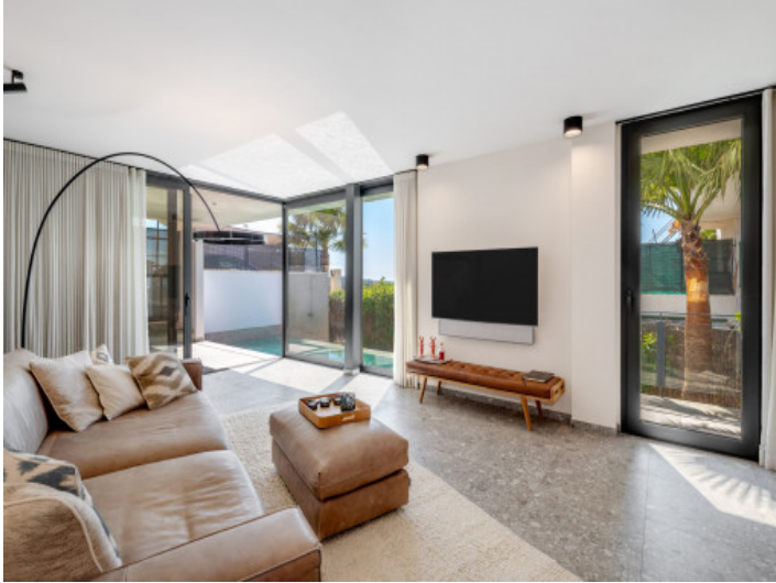
Open-plan living area on the ground floor