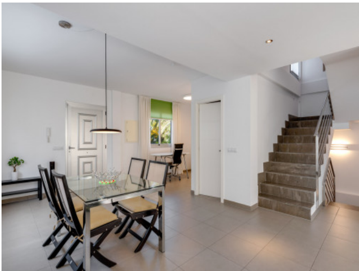
Open dining and living space