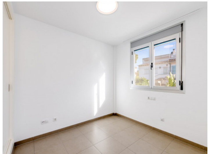
One of three bedrooms