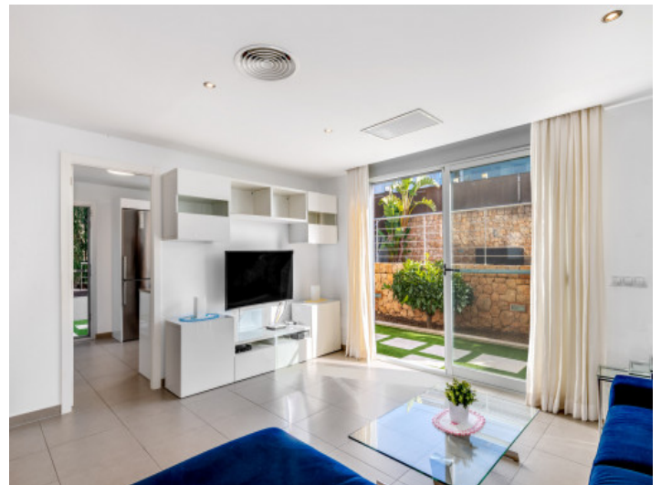
living area with exit to the poolterrace