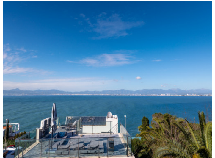
Rooftop terrace with spectacular sea view