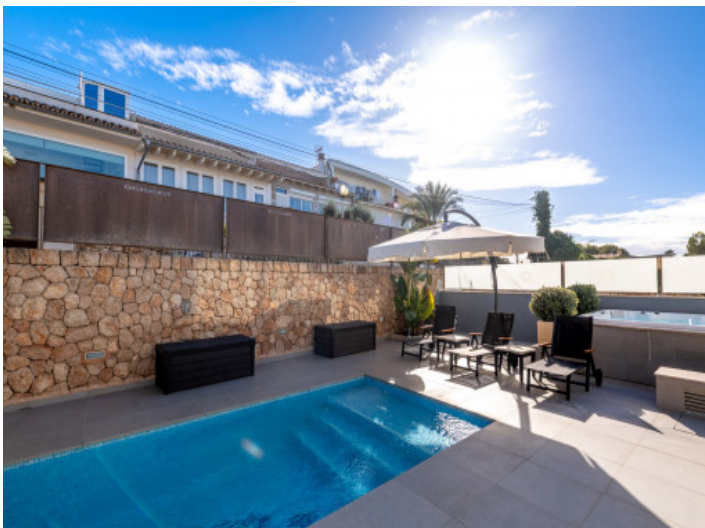
Pool and jacuzzi area