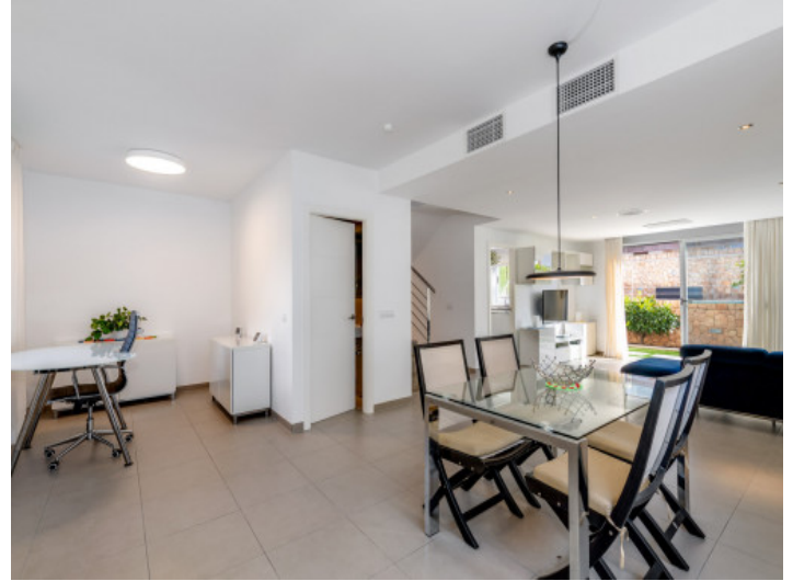
Open dining and living space