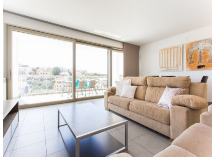
Bright living area with access to the terrace