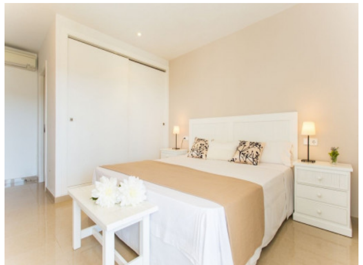
One of three bedrooms with bathroom en suite

All information is correct to the best of our knowledge. Errors and prior sale excepted. This prospectus is purely for information purposes. Only the notarized deed of sale is legally binding.