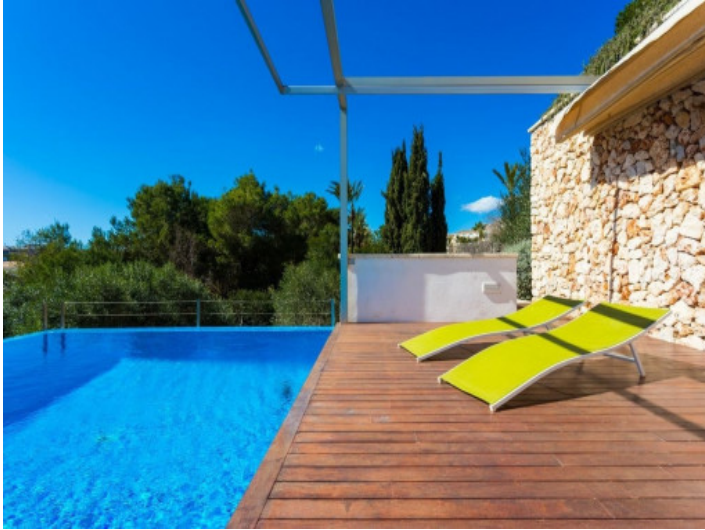
Wonderful pool area