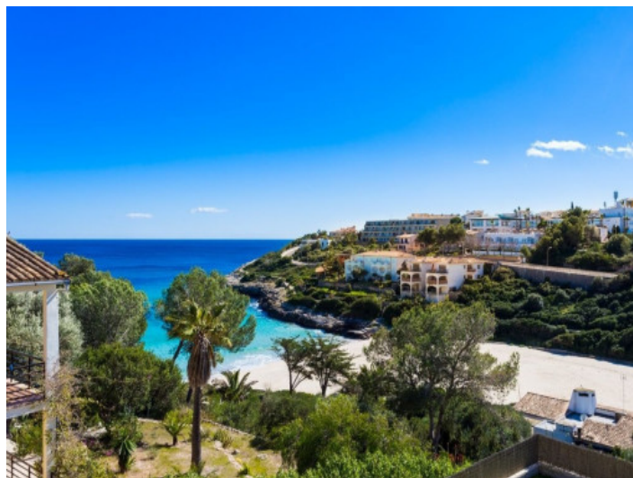
Exclusive situation near the sea

All information is correct to the best of our knowledge. Errors and prior sale excepted. This prospectus is purely for information purposes. Only the notarized deed of sale is legally binding.