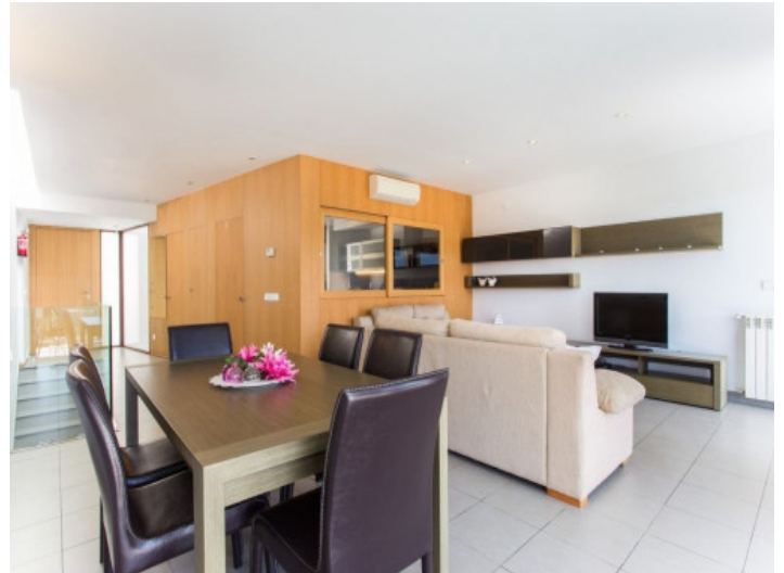
Open living and dining area and separated kitchen