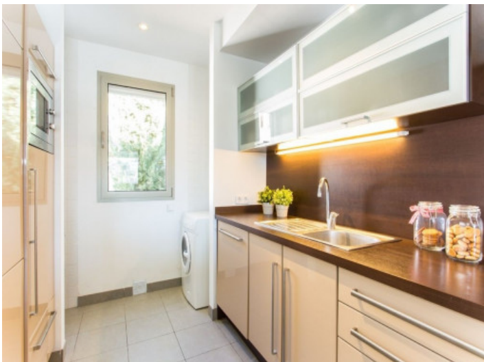
Kitchen and laundry