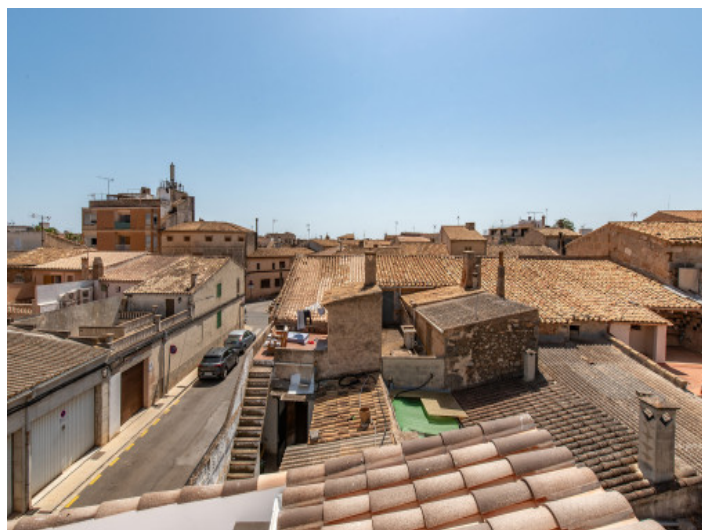
View over Campos

All information is correct to the best of our knowledge. Errors and prior sale excepted. This prospectus is purely for information purposes. Only the notarized deed of sale is legally binding.