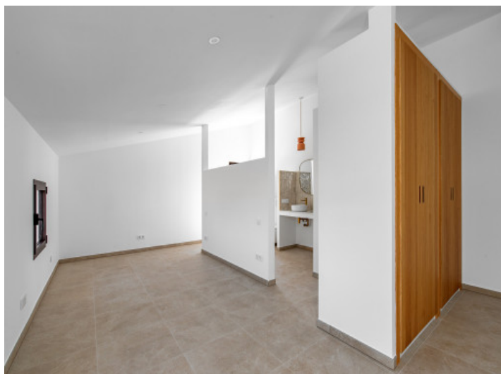
Master Bedroom with bathroom en Suite