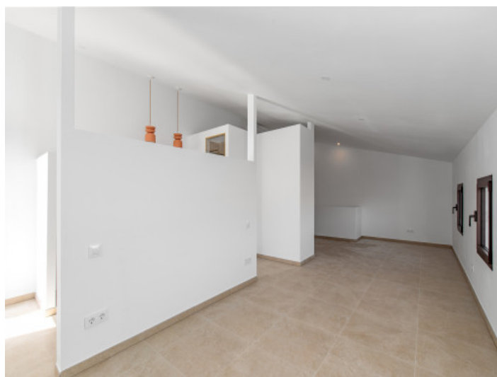
Large Master Bedroom