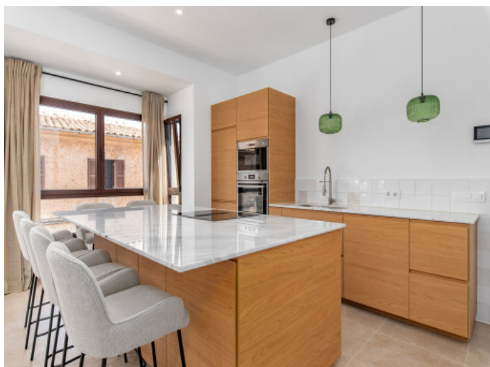
Totally equipped kitchen