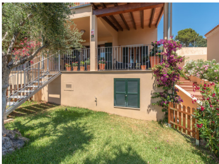
Garden with access to the basement