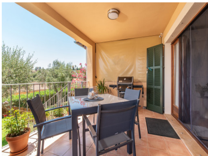
Terrace with access to the garden