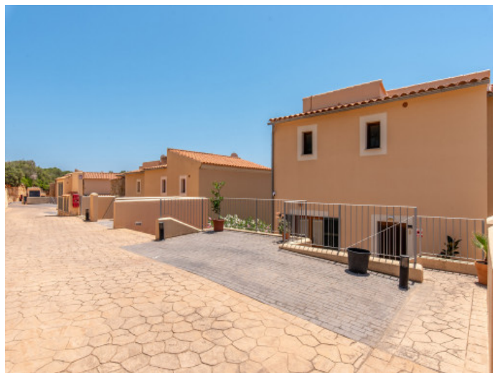
Parking space at the house