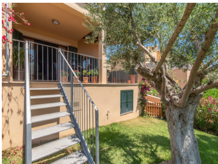
Access to the garden