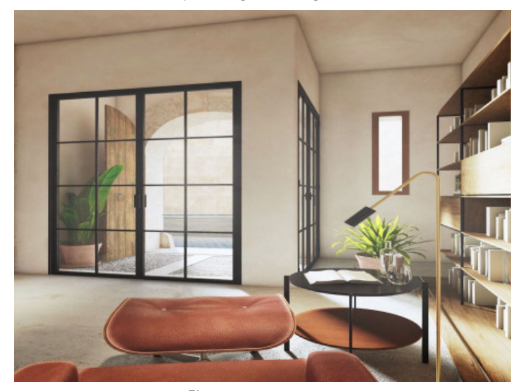
Elegante entrance area