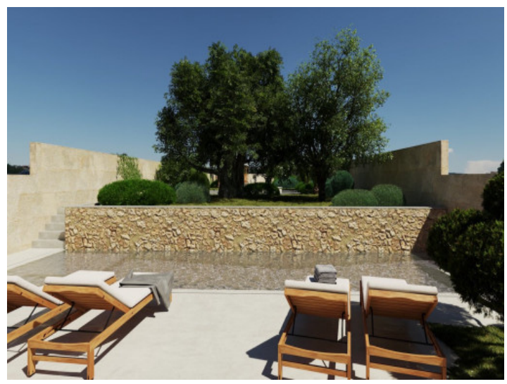
Newly-built townhouse with pool