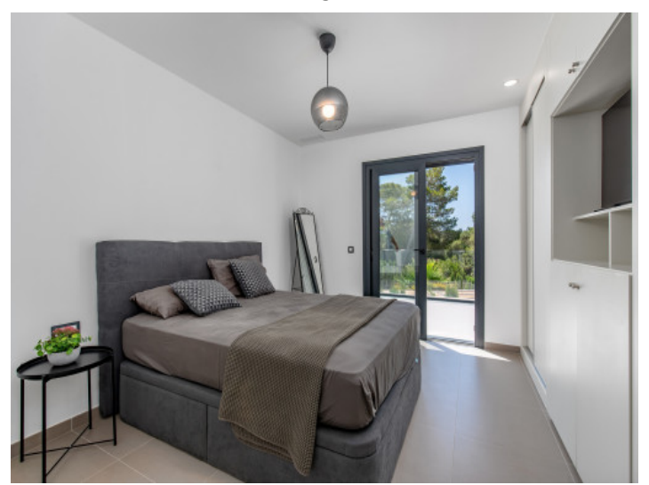
Master bedroom All information is correct to the best of our knowledge. Errors and prior sale excepted. This prospectus is purely for information purposes. Only the notarized deed of sale is legally binding.