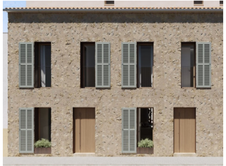
Front of the house (house A & B)