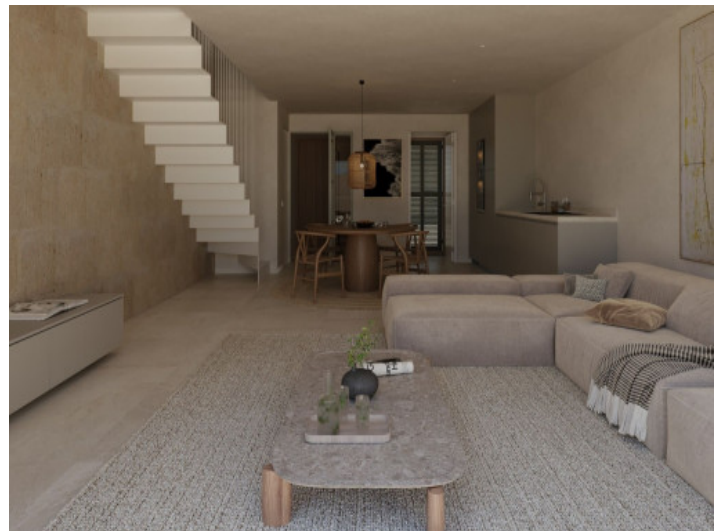
Open kitchen concept