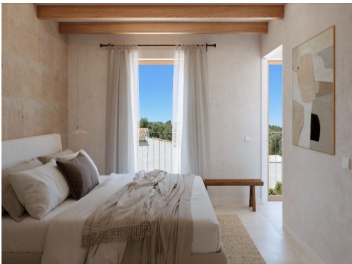
One of the three bedrooms