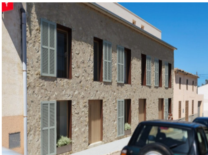
Front of the house

All information is correct to the best of our knowledge. Errors and prior sale excepted. This prospectus is purely for information purposes. Only the notarized deed of sale is legally binding.