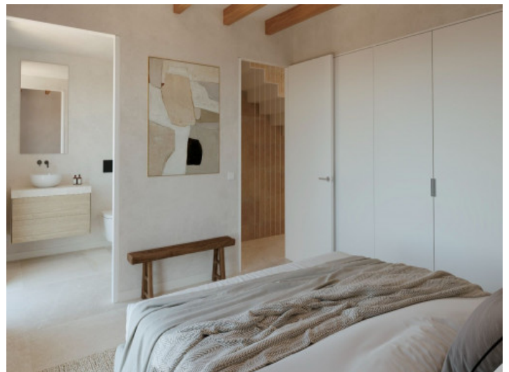
One of the three bedrooms

All information is correct to the best of our knowledge. Errors and prior sale excepted. This prospectus is purely for information purposes. Only the notarized deed of sale is legally binding.