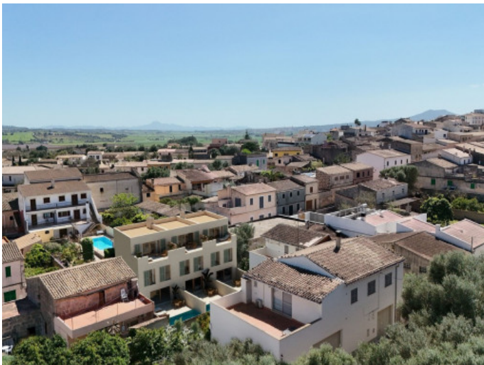
Houses from above