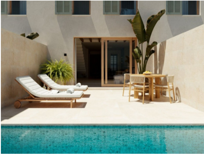
Newly-built townhouse in Ariany