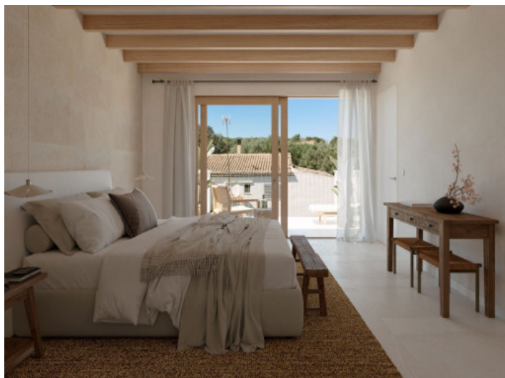
One of the three bedrooms