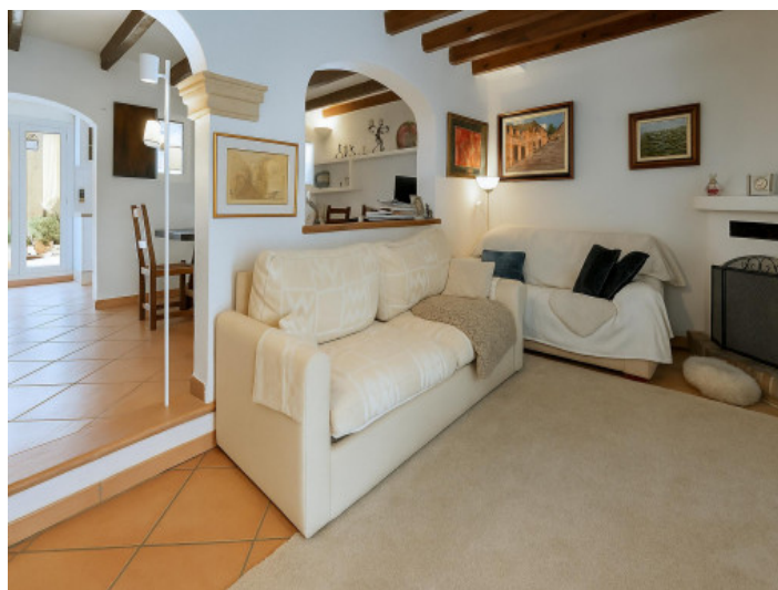
Cozy living room with wooden beams