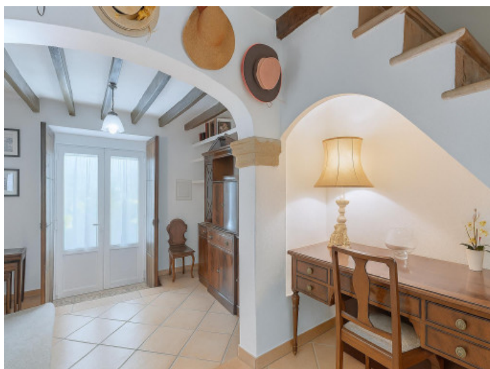
Classic staircase with stone details