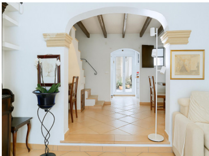
Elegant archway with hallway view