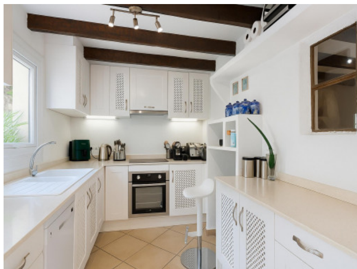
White modern kitchen with traditional beams

All information is correct to the best of our knowledge. Errors and prior sale excepted. This prospectus is purely for information purposes. Only the notarized deed of sale is legally binding.