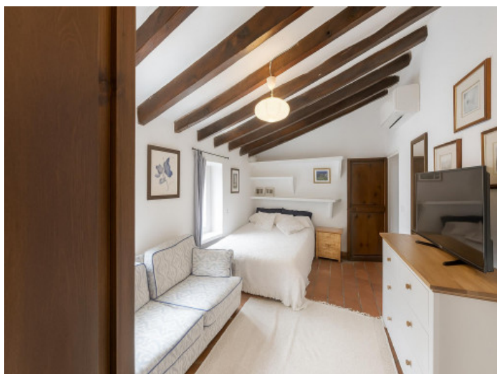
Second bedroom with beamed ceiling