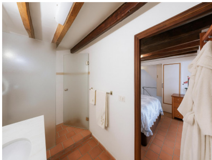
Bathroom with walk-in shower and wood details