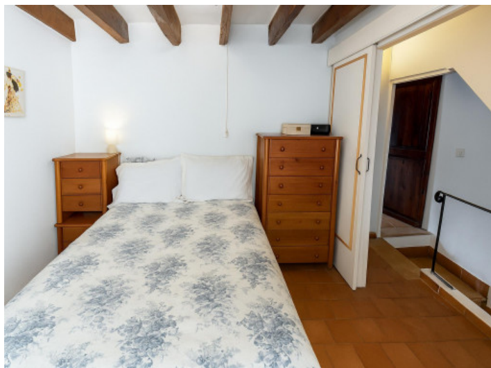
Cozy master bedroom with wooden furniture