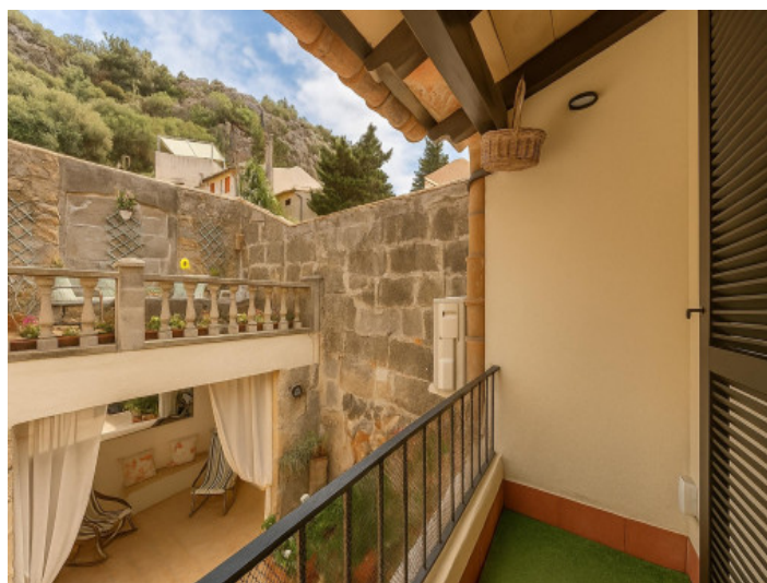
Upper balcony with traditional shutters