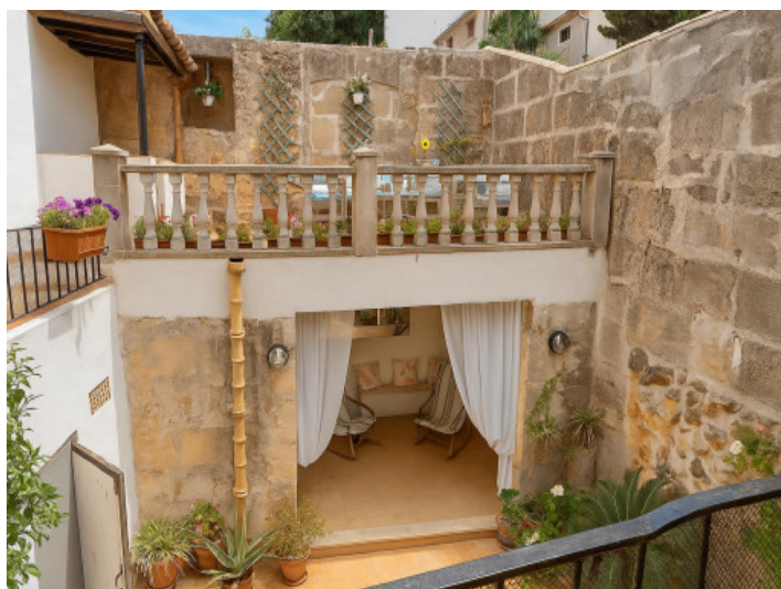
Charming terrace with plants