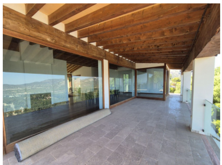
Terrace with views