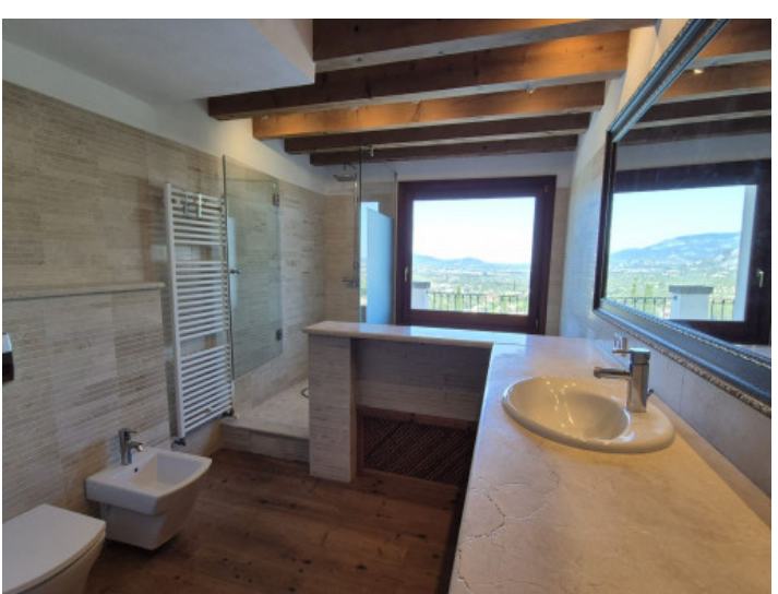
Bathroom All information is correct to the best of our knowledge. Errors and prior sale excepted. This prospectus is purely for information purposes. Only the notarized deed of sale is legally binding.

PORTA MALLORQUINA • THERESIENSTR.: 81, 80333 MUNICH TEL. +34 971 698 242 • INFO@PORTAMALLORQUINA.COM