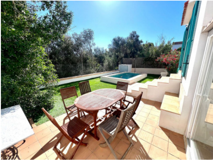
Terrace at the pool