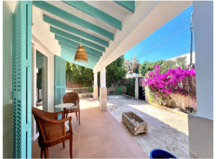
Covered terrace in the front