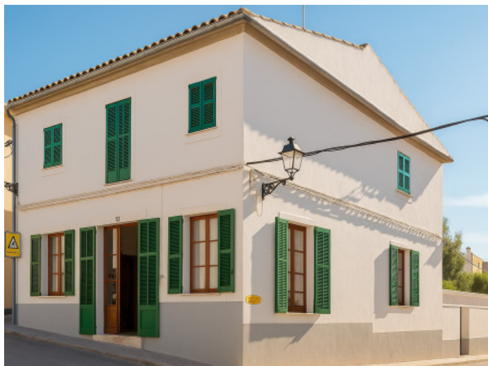
Street view of the townhouse

All information is correct to the best of our knowledge. Errors and prior sale excepted. This prospectus is purely for information purposes. Only the notarized deed of sale is legally binding.