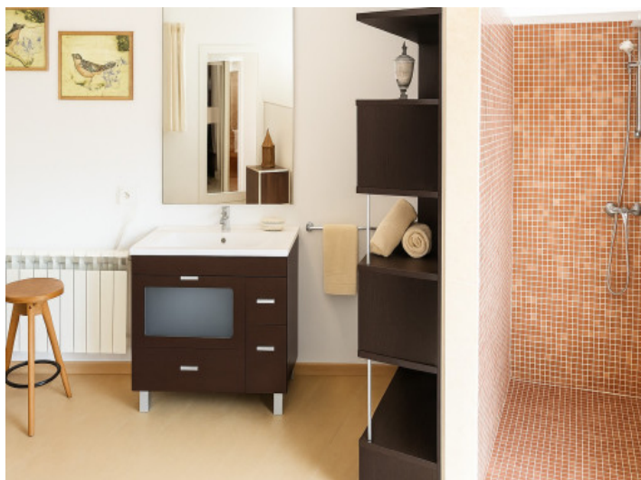
Bathroom on the upper floor