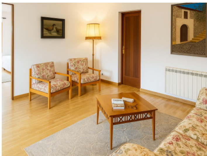
Living area on the upper floor