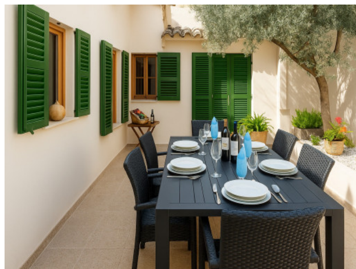
Dining area in private ambience