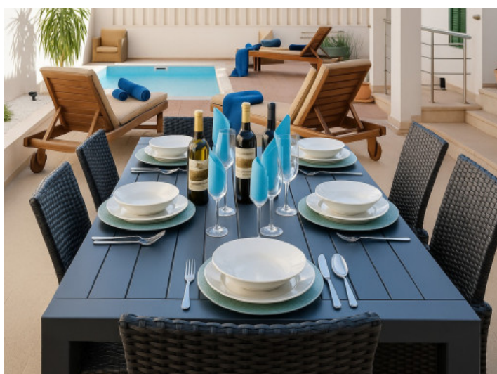
Dining area with views towards the swimmingpool