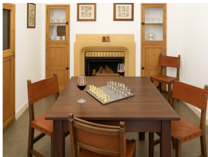
Dining area in the kitchen

All information is correct to the best of our knowledge. Errors and prior sale excepted. This prospectus is purely for information purposes. Only the notarized deed of sale is legally binding.