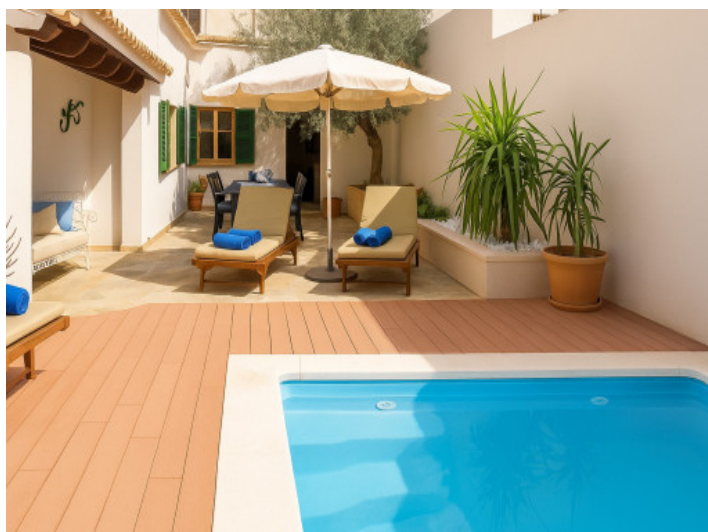
Patio with swimmingpool