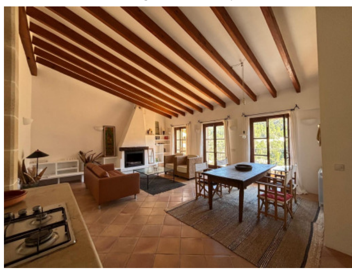
Spacious living area