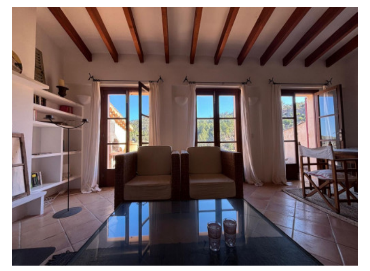
Living area with chimney

PORTA MALLORQUINA® Your home. Our passion.