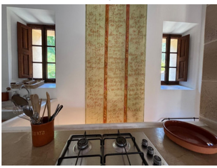
Simple kitchen Kitchen All information is correct to the best of our knowledge. Errors and prior sale excepted. This prospectus is purely for information purposes. Only the notarized deed of sale is legally binding.

PORTA MALLORQUINA • THERESIENSTR.: 81, 80333 MUNICH TEL. +34 971 698 242 • INFO@PORTAMALLORQUINA.COM