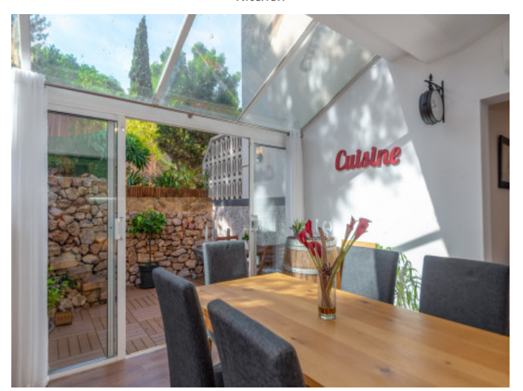
Glass-enclosed terrace Terrace All information is correct to the best of our knowledge. Errors and prior sale excepted. This prospectus is purely for information purposes. Only the notarized deed of sale is legally binding.