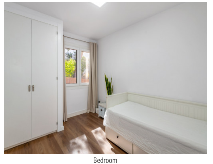
Bedroom Bathroom upstairs All information is correct to the best of our knowledge. Errors and prior sale excepted. This prospectus is purely for information purposes. Only the notarized deed of sale is legally binding.

PORTA MALLORQUINA • THERESIENSTR.: 81, 80333 MUNICH TEL. +34 971 698 242 • INFO@PORTAMALLORQUINA.COM