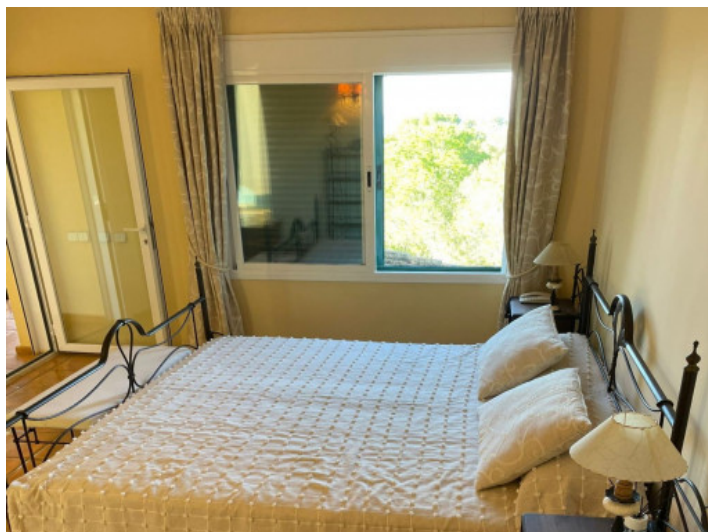
One of 8 bedrooms