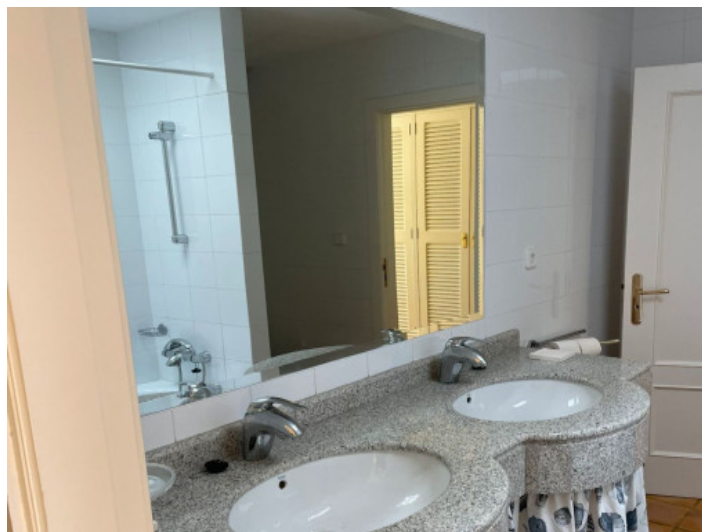
One of 8 bathrooms