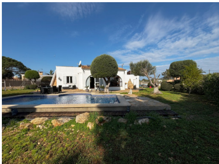
House Cala Murada