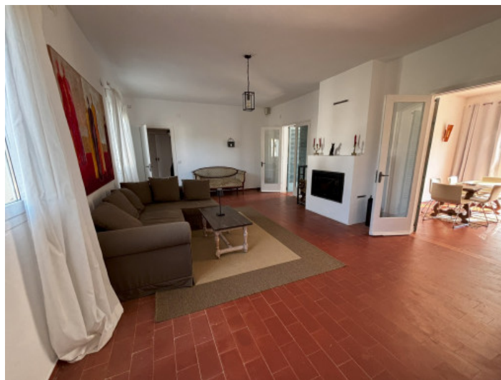
Living area with chimney