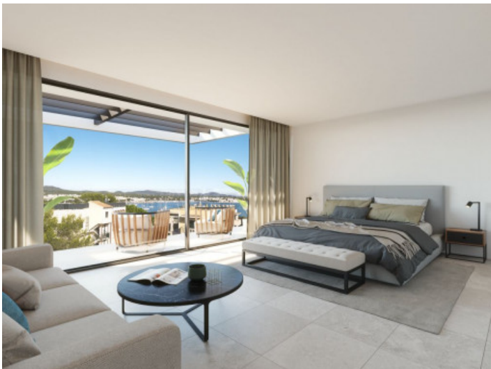
Master bedroom with a view