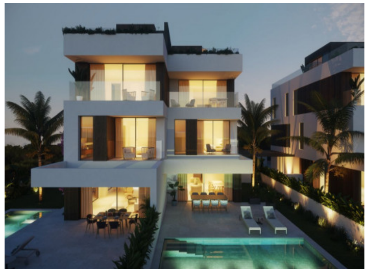
The house at night

All information is correct to the best of our knowledge. Errors and prior sale excepted. This prospectus is purely for information purposes. Only the notarized deed of sale is legally binding.