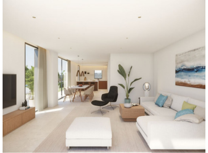
Alternative view of the living area