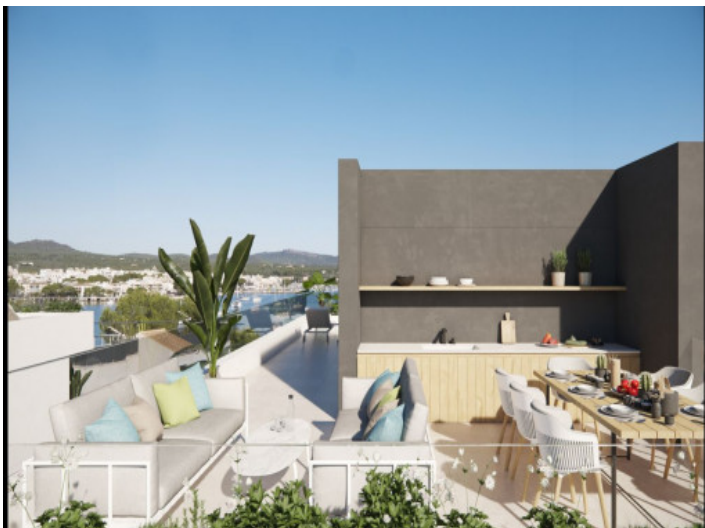
Spacious roof top terrace