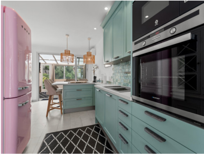
Custom made kitchen