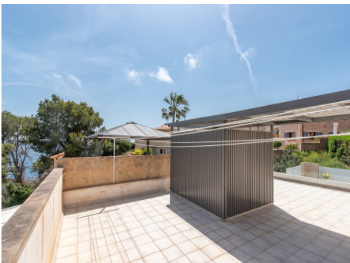
Rooftop terrace with Seaview