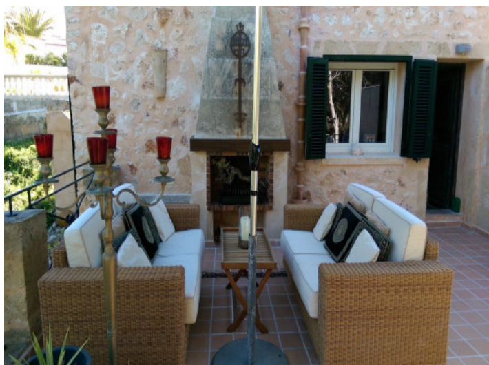
Inviting fireplace terrace