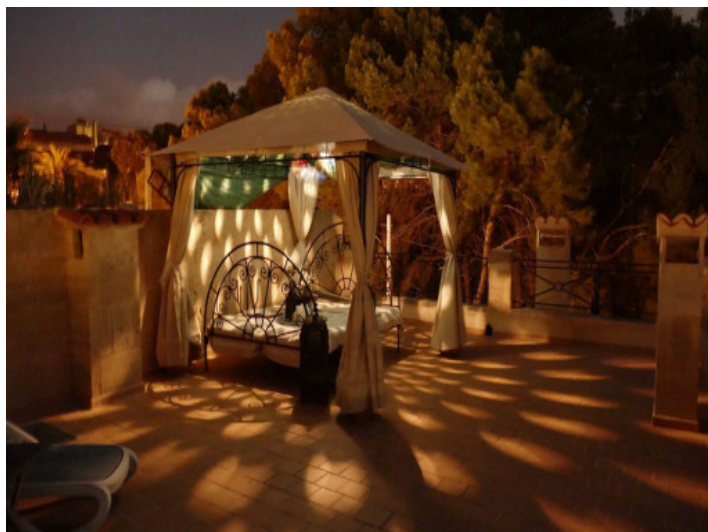
Roof terrace evening atmosphere