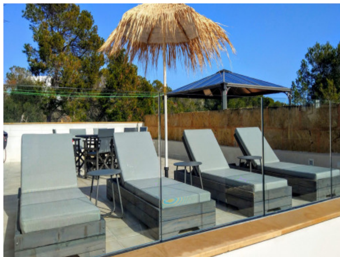
Roof terrace with sun loungers