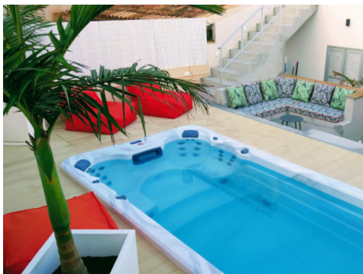
Jacuzzi with counter-current system