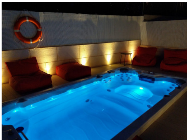
Jacuzzi evening atmosphere