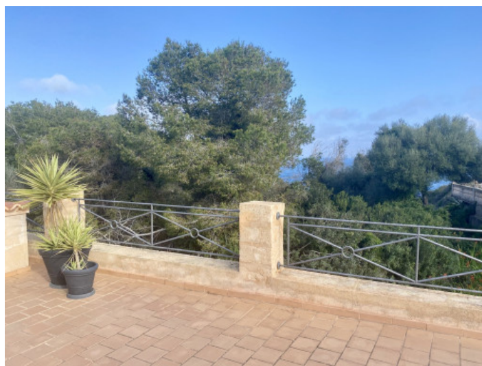
Rooftop terrace with sea view