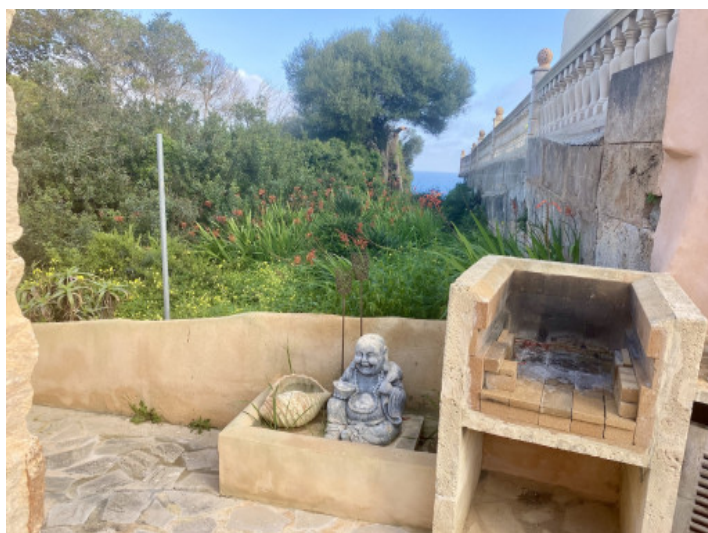
Barbecue area with sea view