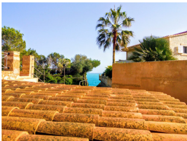
Sea view House 1