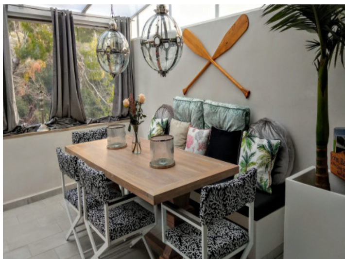
Cosy conservatory House 1