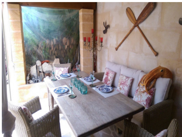
Covered terrace House 2

All information is correct to the best of our knowledge. Errors and prior sale excepted. This prospectus is purely for information purposes. Only the notarized deed of sale is legally binding.