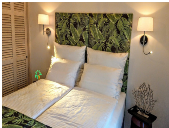
One of 2 bedrooms House 1

All information is correct to the best of our knowledge. Errors and prior sale excepted. This prospectus is purely for information purposes. Only the notarized deed of sale is legally binding.