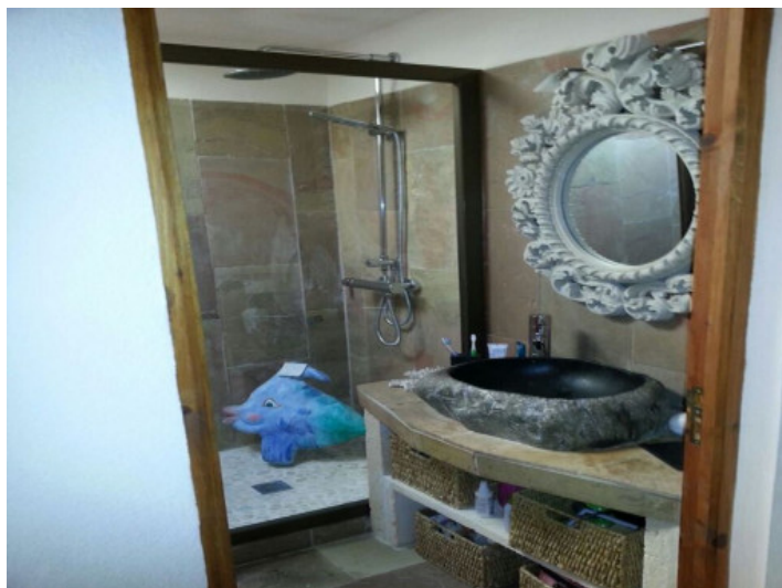
Bathroom House 2