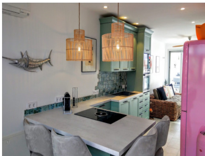
Open, well-equipped kitchen House 1