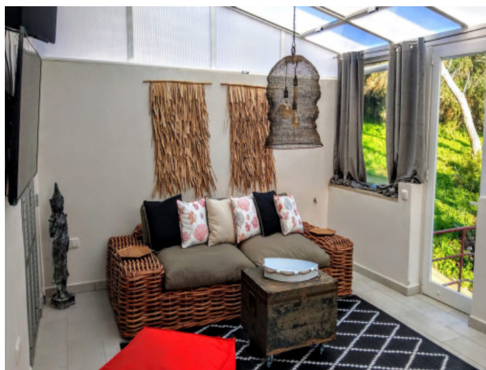
Living area with views to the Garden House 1