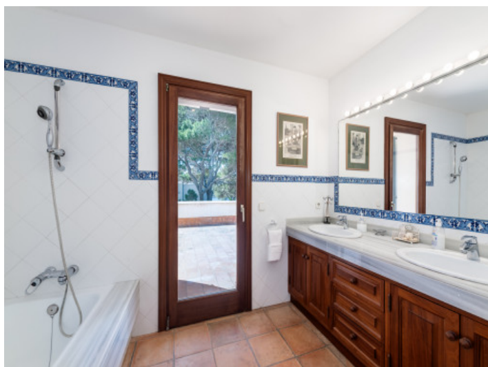
One of seven bathrooms