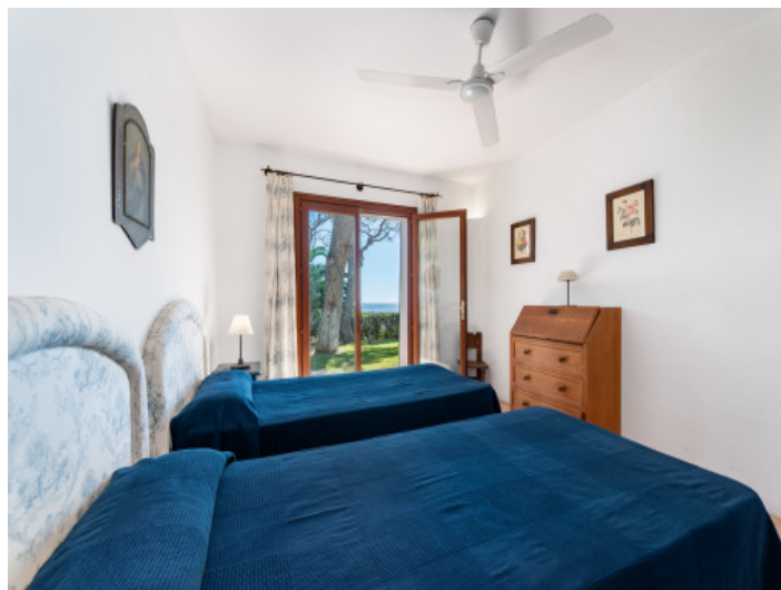
One of seven bedrooms