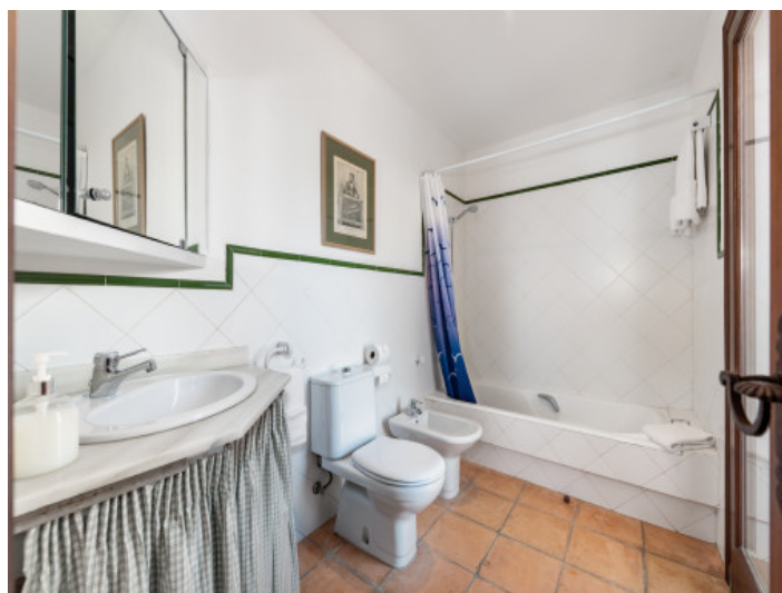
One of seven bathrooms