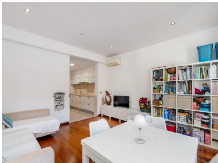
Dining and living area