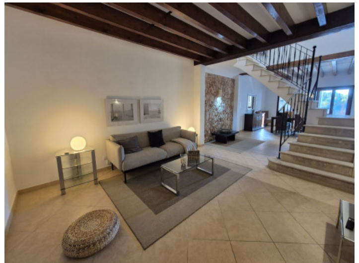
Cozy living and dining area