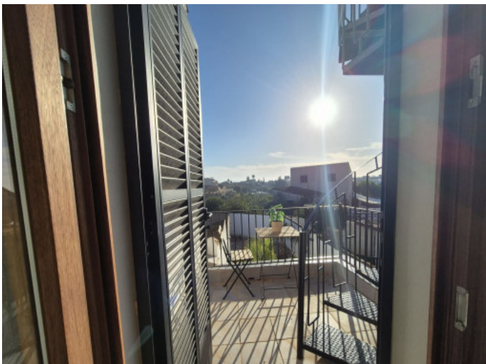
View to the rooftop terrace