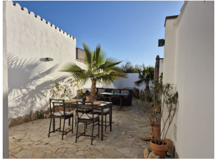
Tastefully renovated townhouse with cozy patio in Llucmajor