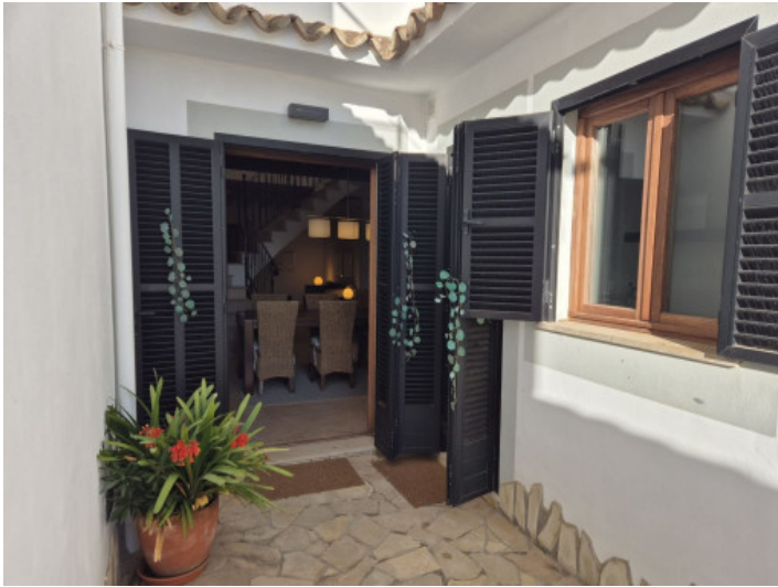
View from the patio to the dining area