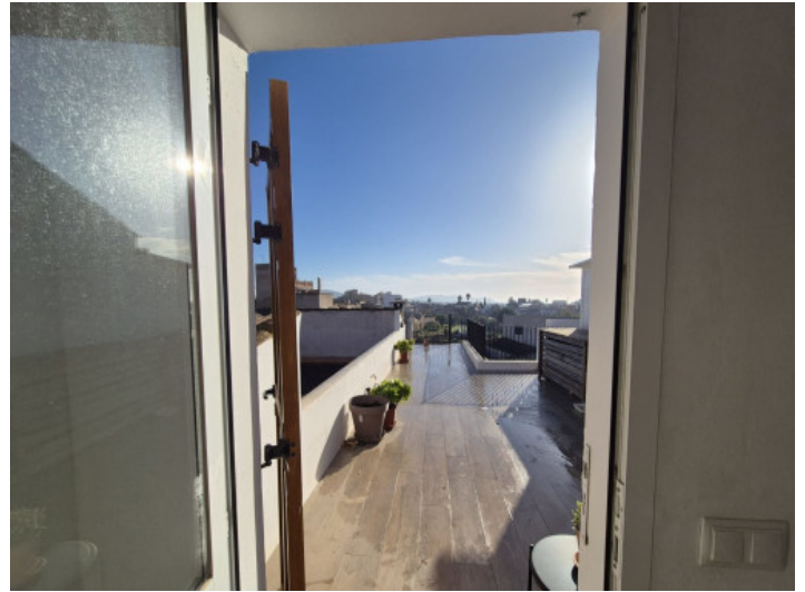
Access to the rooftop terrace