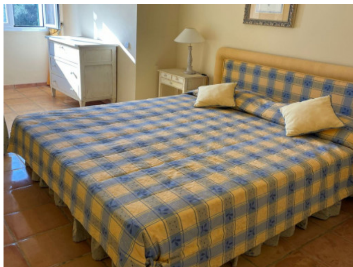
One of 8 bedrooms

All information is correct to the best of our knowledge. Errors and prior sale excepted. This prospectus is purely for information purposes. Only the notarized deed of sale is legally binding.