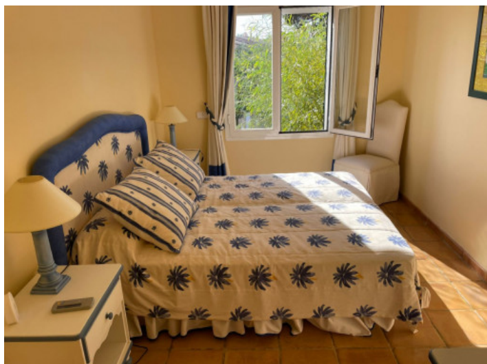
One of 8 bedrooms