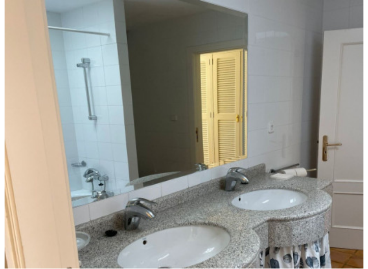
One of 8 bathrooms