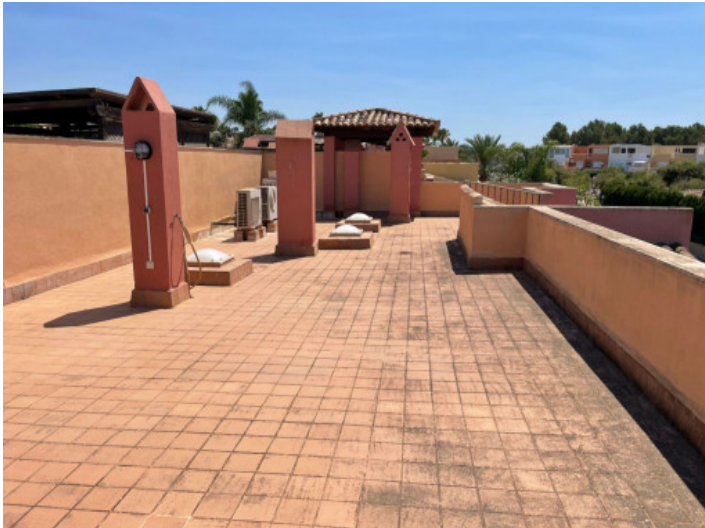
Roof top terrace