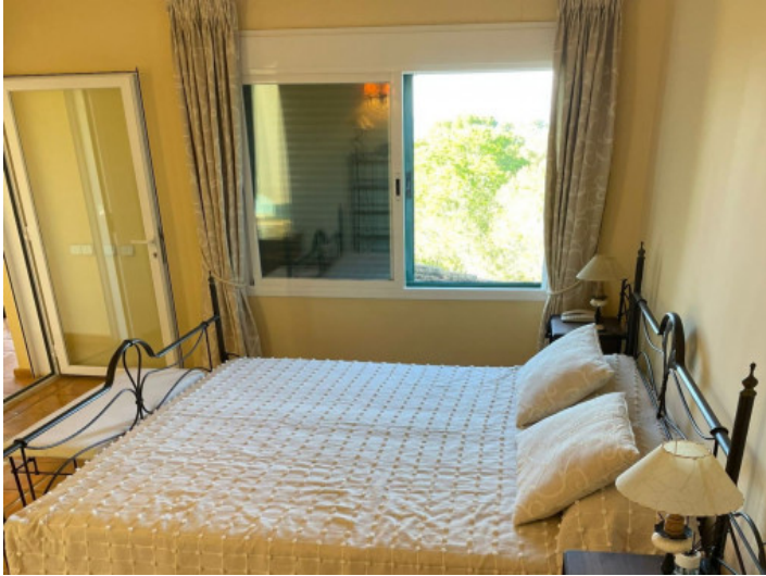
One of 8 bedrooms