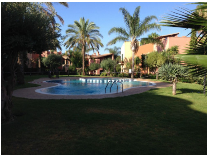
Community garden and pool

All information is correct to the best of our knowledge. Errors and prior sale excepted. This prospectus is purely for information purposes. Only the notarized deed of sale is legally binding.