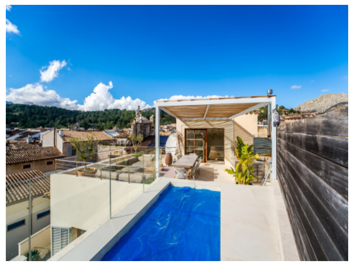
Roof top terrace with pool