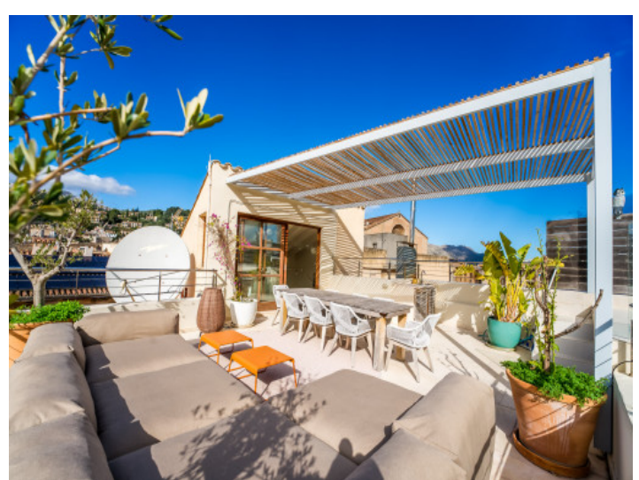
Roof top terrace with a view