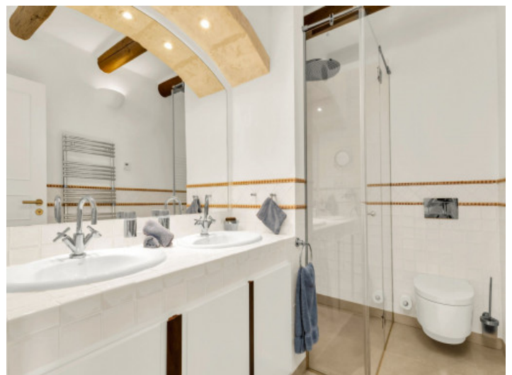
Bathroom with walk-in shower

All information is correct to the best of our knowledge. Errors and prior sale excepted. This prospectus is purely for information purposes. Only the notarized deed of sale is legally binding.