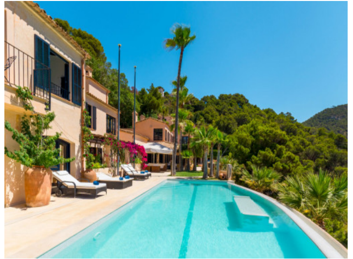
Beautiful pool area