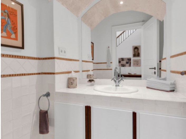
Bathroom guest area