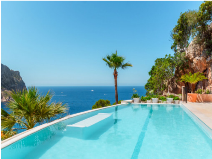
Fantastic pool area