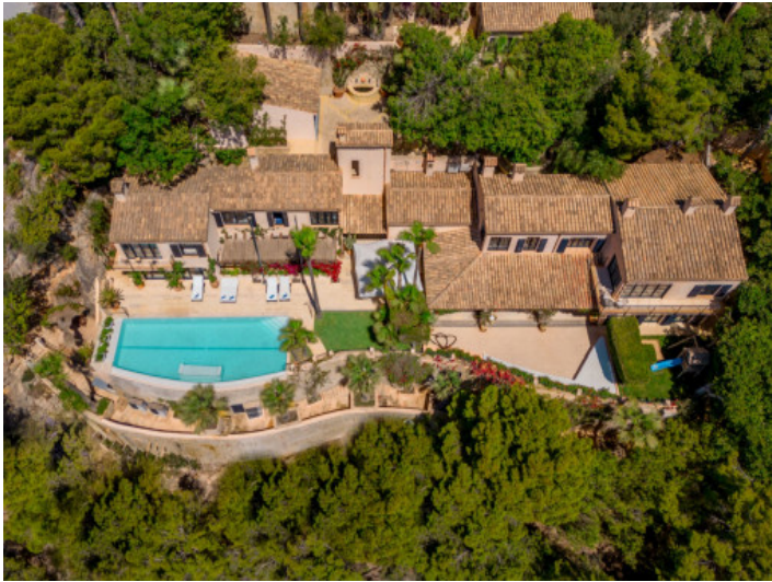
View to this amazing property