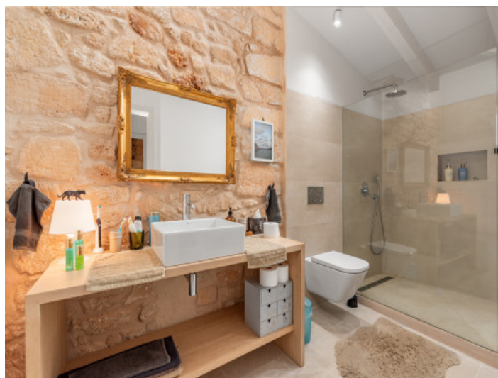
Upper floor bathroom