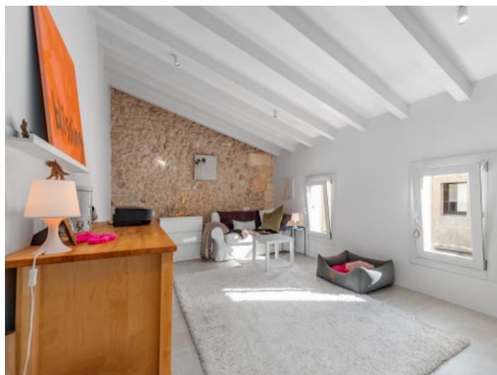
Large bedroom or living area on the upper floor

All information is correct to the best of our knowledge. Errors and prior sale excepted. This prospectus is purely for information purposes. Only the notarized deed of sale is legally binding.