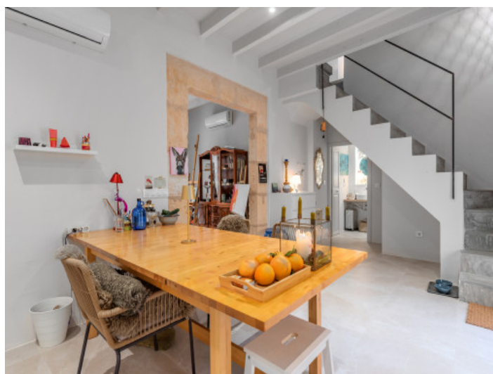
Dining area, bathroom and staircase

All information is correct to the best of our knowledge. Errors and prior sale excepted. This prospectus is purely for information purposes. Only the notarized deed of sale is legally binding.