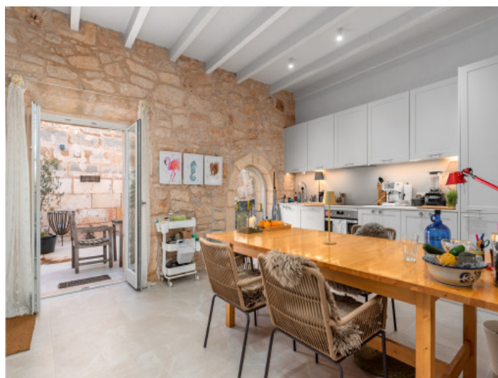
Large dining table