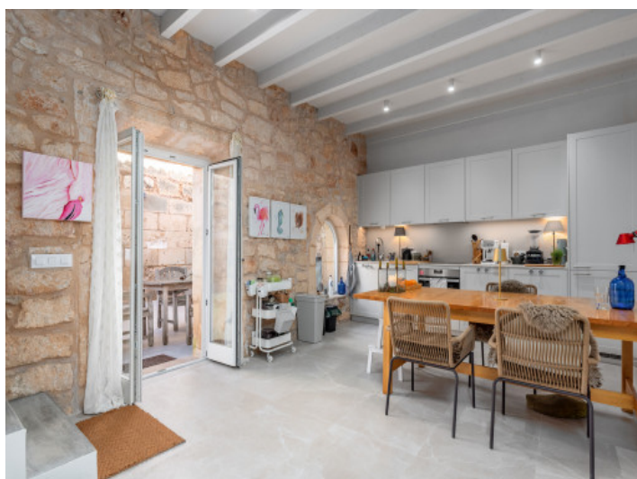
Country style kitchen