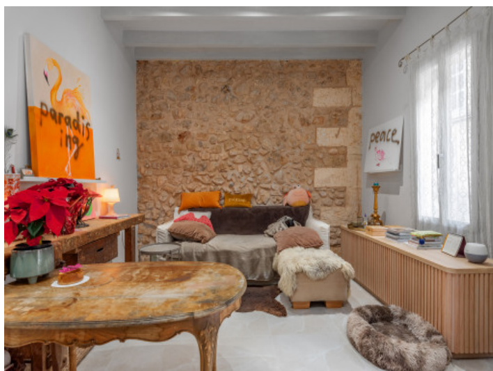
Cozy living area