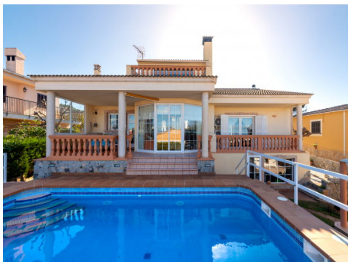
Exclusive villa with spectacular sea views in Bahía Azul